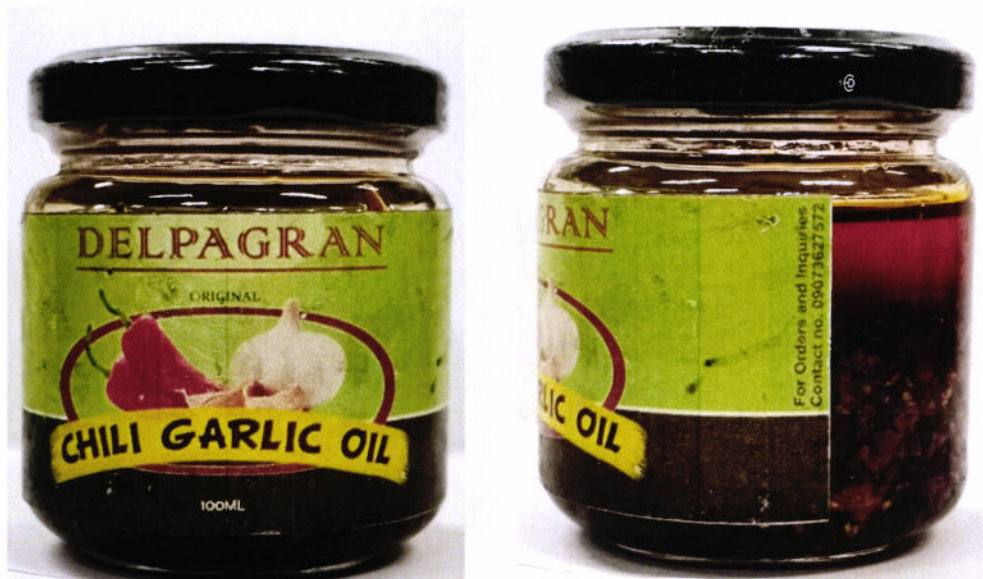
Figure 3. Unregistered DELPAGRAN Original Chili Garlic Oil