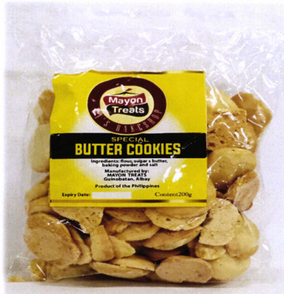
Figure 1. Unregistered MAYON TREATS Special Butter Cookies

The Food and Drug Administration (FDA) advises the public from purchasing and consuming the following unregistered food products: