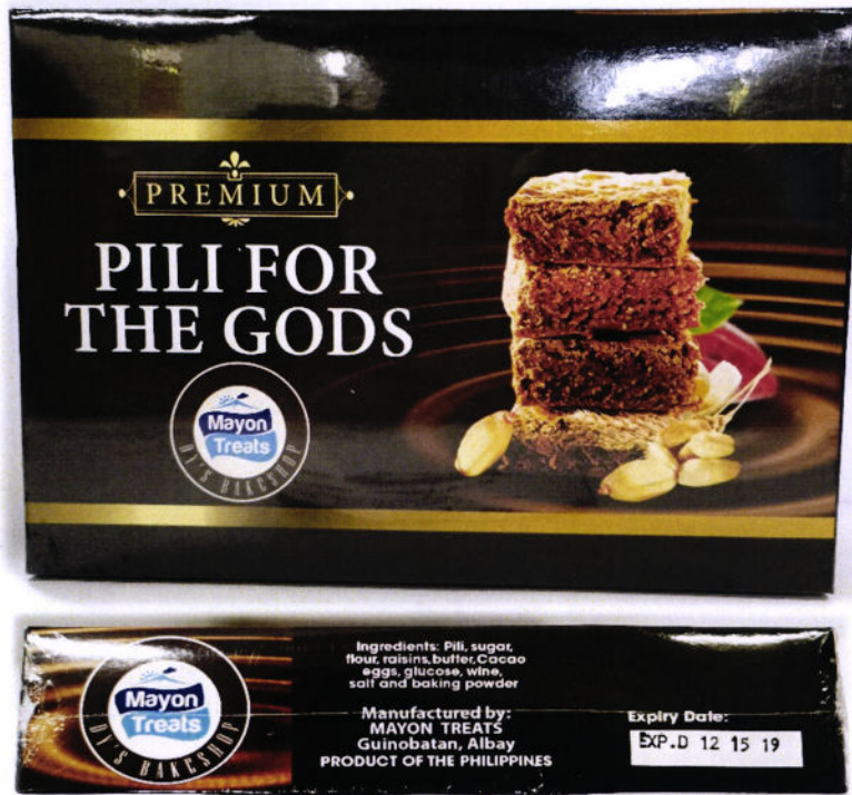
Figure 5. Unregistered MAYON TREATS PREMIUM Pili for the Gods

The FDA verified through post-marketing surveillance that the abovementioned food products are not authorized and the Certificates of Product Registration (CPR) have not been issued. Pursuant to the Republic Act No. 9711, otherwise known as the “Food and Drug Administration Act of 2009”, the manufacture, importation, exportation, sale, offering for sale, distribution,