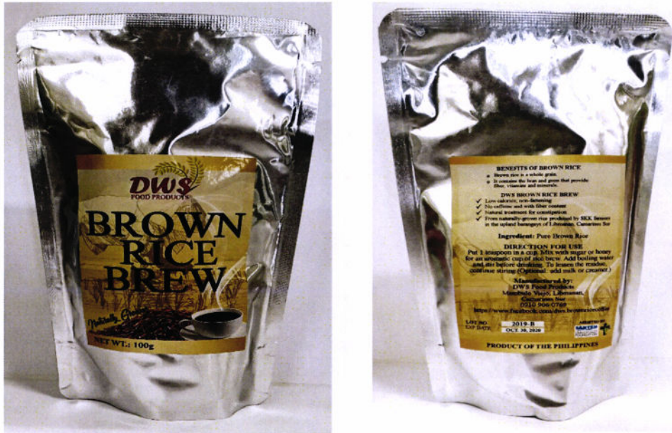
Figure 4. Unregistered DWS FOOD PRODUCT Brown Rice Brew