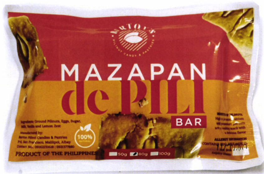
Figure 2. Unregistered BERTON'S PILINUT CANDY & PASTRIES Mazapan de Pili Bar