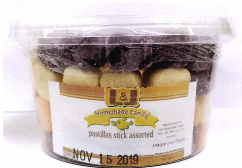
Figure 3. Unregistered L&J HOMEMADE CANDY Pastillas Stick Assorted