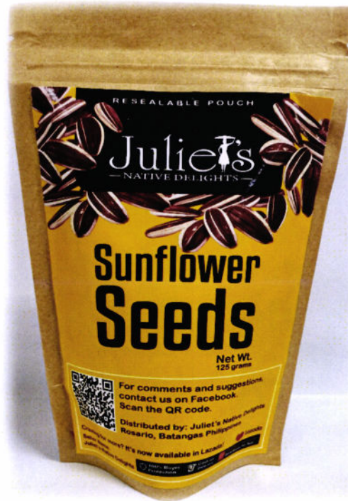
Figure 2. Unregistered JULIET'S NATIVE DELIGHTS Sunflower Seeds