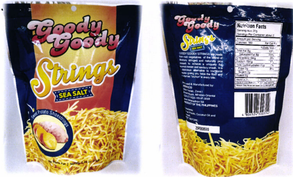
Figure 4. Unregistered GOODY GOODY Strings Sea Salt Sweet Potato Shoestrings