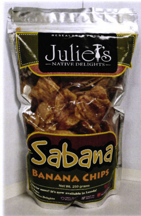
Figure 1. Unregistered JULIET'S NATIVE DELIGHTS SABANA Banana Chips

The Food and Drug Administration (FDA) advises the public from purchasing and consuming the following unregistered food products: