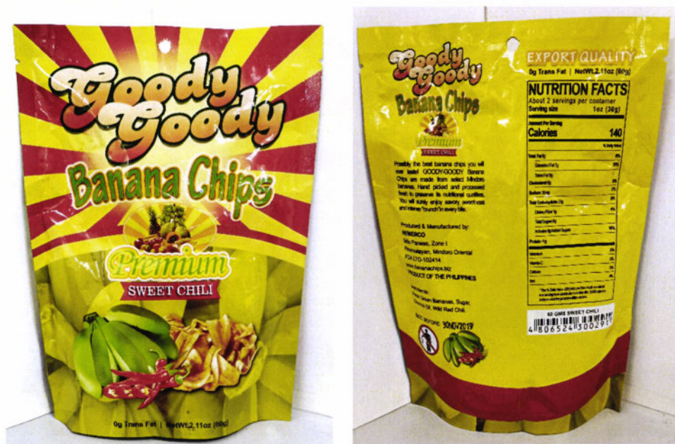
Figure 5. Unregistered GOODY GOODY Banana Chips Premium Sweet Chili

The FDA verified through post-marketing surveillance that the abovementioned food products are not authorized and the Certificates of Product Registration (CPR) have not been issued. Pursuant to the Republic Act No. 9711, otherwise known as the “Food and Drug Administration Act of 2009”, the manufacture, importation, exportation, sale, offering for sale, distribution, transfer, non-consumer use, promotion, advertising or sponsorship of health products without the proper authorization is prohibited.