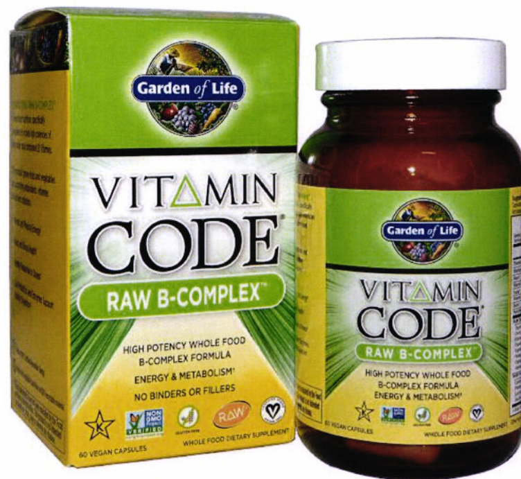
Figure 3. Unregistered GARDEN OF LIFE VITAMIN CODE Raw B-Complex Whole Food Dietary Supplement (120 vegan capsules)