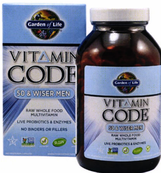
Figure 1. Unregistered GARDEN OF LIFE VITAMIN CODE 50 & WISER MEN Raw Whole Food Multivitamin Dietary Supplement (120 vegetarian capsules)

The Food and Drug Administration (FDA) warns the public from purchasing and consuming the following unregistered food supplements: