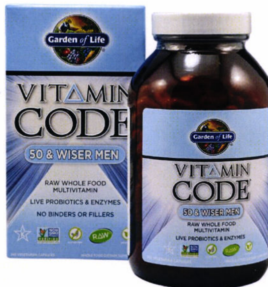
Figure 1. Unregistered GARDEN OF LIFE VITAMIN CODE 50 & WISER MEN Raw Whole Food Multivitamin Dietary Supplement (120 vegetarian capsules)

The Food and Drug Administration (FDA) warns the public from purchasing and consuming the following unregistered food supplements: