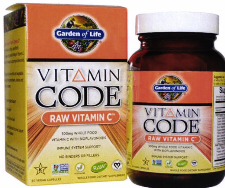
Figure 5. Unregistered GARDEN OF LIFE VITAMIN CODE Raw Vitamin C 500mg Whole Food Vitamin C with Bioflavonoids Dietary Supplement (60 vegan capsules)