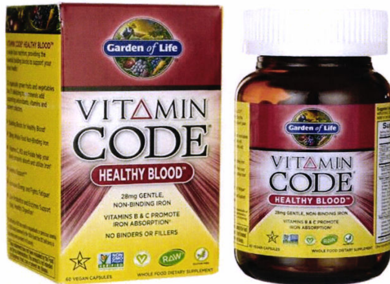
Figure 4. Unregistered GARDEN OF LIFE VITAMIN CODE Healthy Blood 28mg Gentle Non-Binding Iron Whole Food Dietary Supplement (60 vegan capsules)