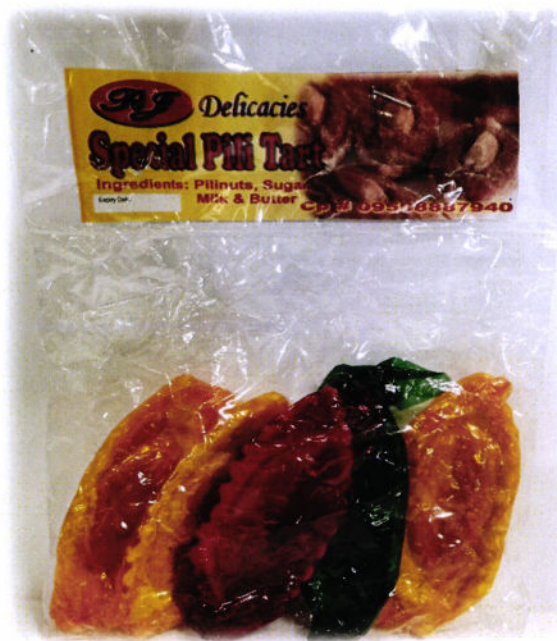
Figure 2. Unregistered RJ Delicacies Special Pili Tart