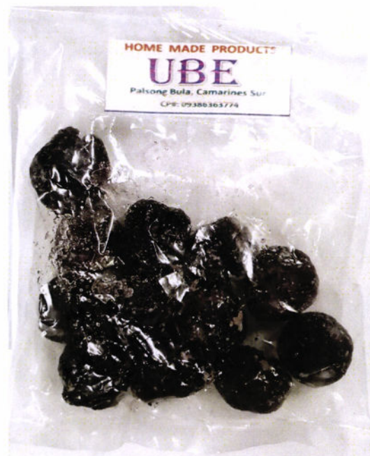
Figure 1. Unregistered HOME MADE Products Ube

The Food and Drug Administration (FDA) advises the public from purchasing and consuming the following unregistered food products: