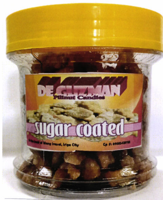
Figure 3. Unregistered DE GUZMAN Pili Nut Candies Sugar Coated