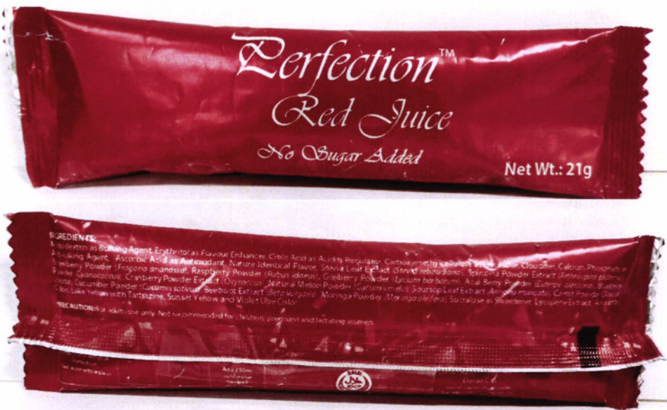
Figure 4. Unregistered PERFECTION™ Red Juice No Sugar Added