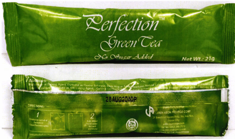
Figure 5. Unregistered PERFECTION™ Green Tea No Sugar Added

The FDA verified through post-marketing surveillance that the abovementioned food products are not authorized and the Certificates of Product Registration (CPR) have not been issued. Pursuant to the Republic Act No. 9711, otherwise known as the “Food and Drug Administration Act of 2009”, the manufacture, importation, exportation, sale, offering for sale, distribution, transfer, non-consumer use, promotion, advertising or sponsorship of health products without the proper authorization is prohibited.