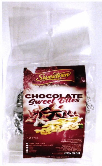
Figure 2. Unregistered SWEETVEN Chocolate Sweet bites-Dark Chocolate