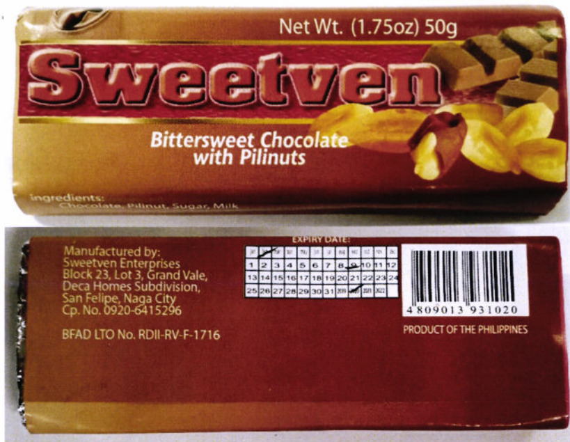
Figure 4. Unregistered SWEETVEN Bittersweet Chocolate with Pilinuts