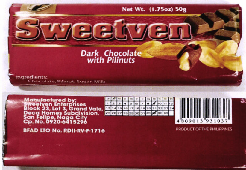
Figure 5. Unregistered SWEETVEN Dark Chocolate with Pilinuts

The FDA verified through post-marketing surveillance that the abovementioned food products are not authorized and the Certificates of Product Registration (CPR) have not been issued. Pursuant to the Republic Act No. 9711, otherwise known as the “Food and Drug Administration Act of 2009”, the manufacture, importation, exportation, sale, offering for sale, distribution, transfer, non-consumer use, promotion, advertising or sponsorship of health products without the proper authorization is prohibited.