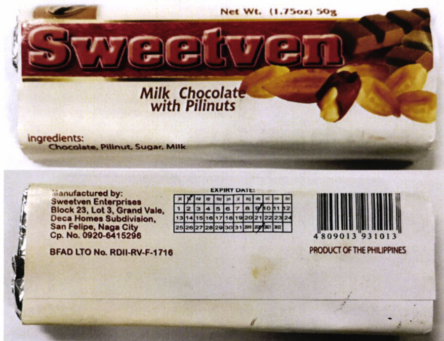
Figure 3. Unregistered SWEETVEN Milk Chocolate with Pilinuts