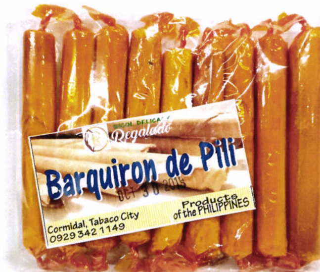
Figure 1. Unregistered BICOL DELICACY REGALADO Baquiron de Pili

The Food and Drug Administration (FDA) advises the public from purchasing and consuming the following unregistered food products: