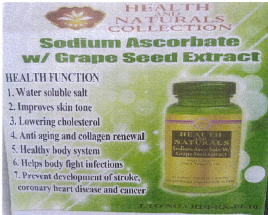
Figure 1. Sample Brochure of Unregistered HEALTH and NATURALS COLLECTION Sodium Ascorbate w/ Grape Seed Extract Veggie Capsules Food Supplement

The Food and Drug Administration (FDA) warns the public from purchasing and consuming the following unregistered food supplements with unapproved advertisements and promotions: