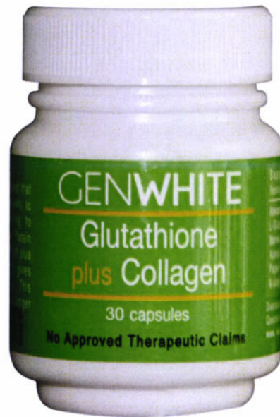
Figure 4. Unregistered GENWHITE Glutathione plus Collagen Capsules