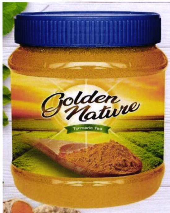
Figure 1. Unregistered GOLDEN NATURE Turmeric Tea

The Food and Drug Administration (FDA) advises the public from purchasing and consuming the following unregistered food products and food supplements: