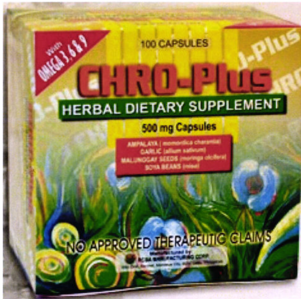
Figure 2. Unregistered CHRO-PLUS Herbal Dietary Supplement 500 mg Capsules