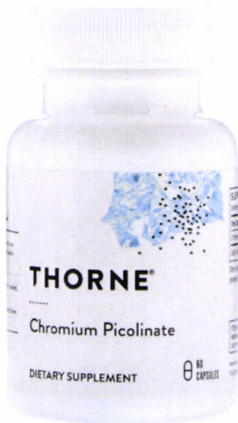
Figure 3. Unregistered THORNE Chromium Picolinate Dietary Supplement Capsules