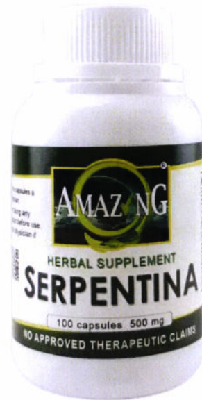
Figure 5. Unregistered AMAZING Serpentina Herbal Supplement Capsules