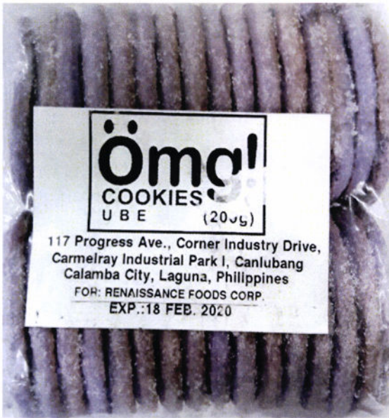
Figure 2. Unregistered OMG! Cookies Ube, 200g