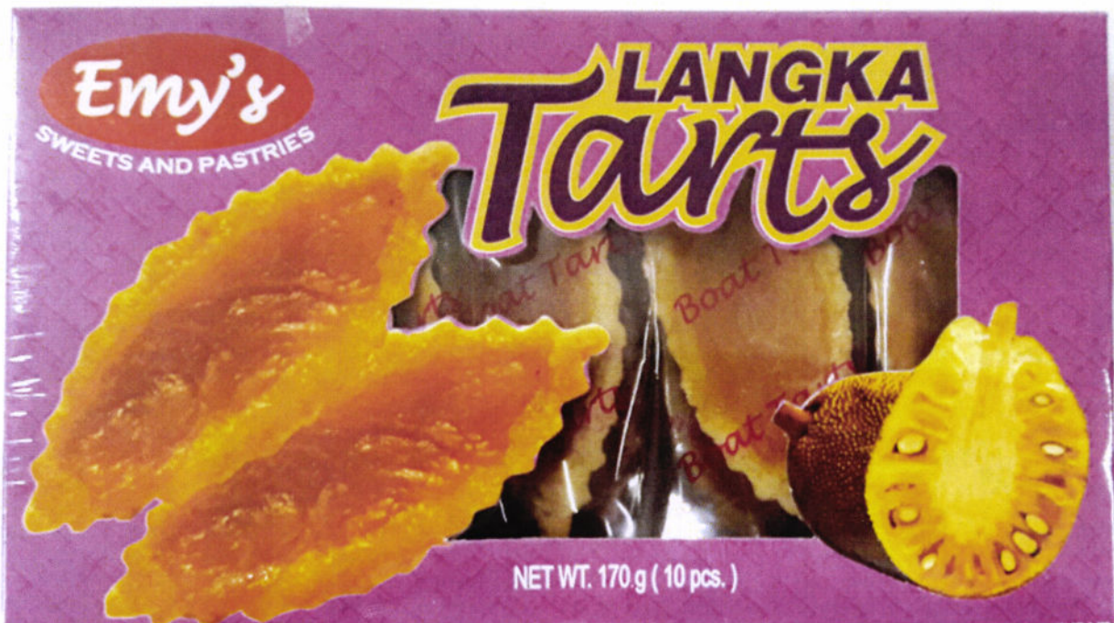
Figure 1. Unregistered EMY'S SWEET AND PASTRIES Langka Tarts, Net Wt. 170g (10pcs)

The Food and Drug Administration (FDA) warns the public from purchasing and consuming the following unregistered food products: