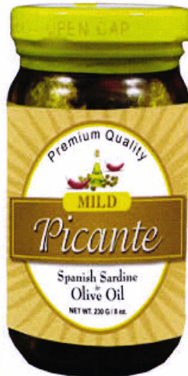
Figure 4. Unregistered PICANTE Spanish Sardine in Olive Oil (Mild), Net Wt. 230g / 8oz