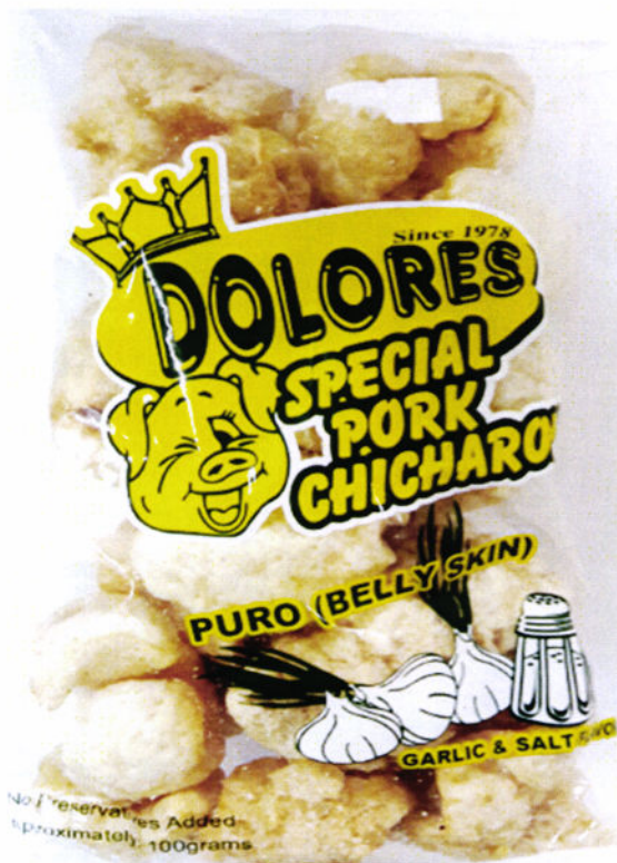
Figure 3. Unregistered DOLORES Special Pork Chicharon Puro (Belly Skin) Garlic & Salt Flavor, Approximately 100grams