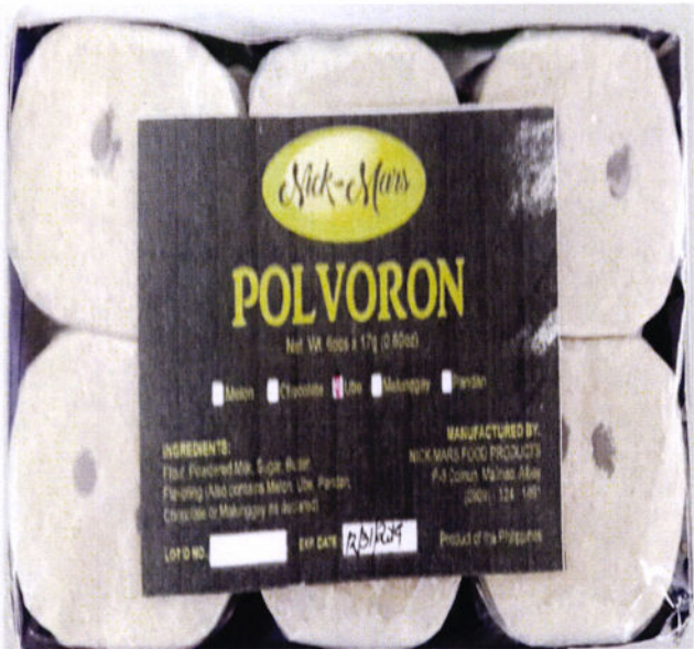
Figure 3. Unregistered NICK-MARS POLVORON, Ube, Net Wt. 6pcs X 17g (0.60oz)