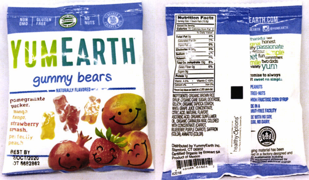
Figure 4. Unregistered YUM EARTH Gummy Bears

The FDA verified through post-marketing surveillance that the abovementioned food products and food supplements are not authorized and the Certificates of Product Registration (CPR) have not been issued. Pursuant to the Republic Act No. 9711, otherwise known as the “Food and Drug Administration Act of 2009”, the manufacture, importation, exportation, sale, offering for sale, distribution, transfer, non-consumer use, promotion, advertising or sponsorship of health products without the proper authorization is prohibited.