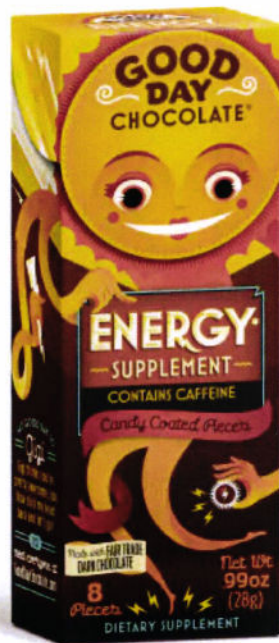
Figure 3. Unregistered GOOD DAY CHOCOLATE ENERGY SUPPLEMENT Candy Coated Pieces Dietary Supplement