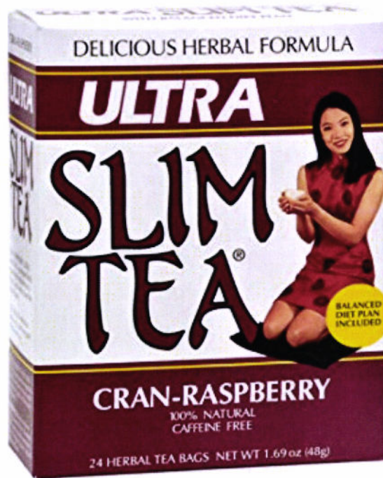
Figure 2. Unregistered DELICIOUS HERBAL FORMULA ULTRA SLIM TEA Cran-Raspberry Herbal Tea