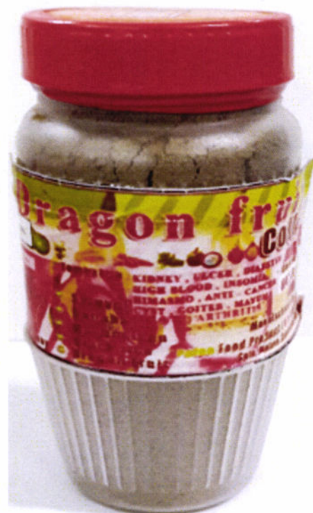
Figure 4. Unregistered Dragon Fruit Coffee, 200g

The FDA verified through post-marketing surveillance that the abovementioned food products are not authorized and the Certificates of Product Registration have not been issued. Pursuant to