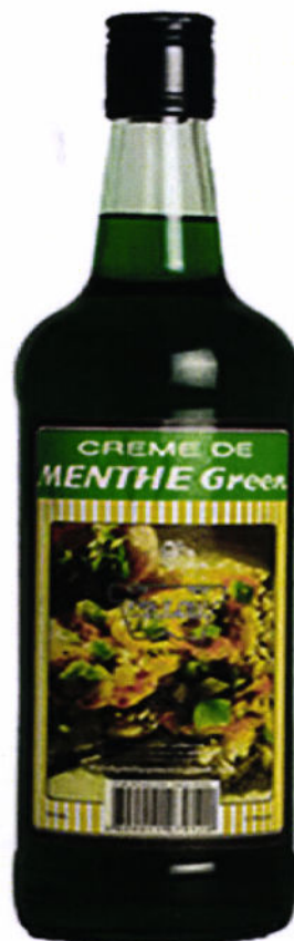
Figure 1. Unregistered CRÈME DE MENTHE GREEN Walsh Liqueur

The Food and Drug Administration (FDA) warns the public from purchasing and consuming the following unregistered food products: