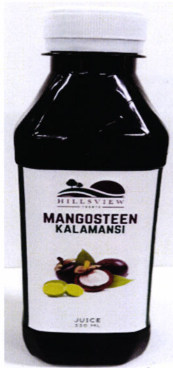
Figure 2. Unregistered HILLSVIEW TRENTO Mangosteen Kalamansi Juice, 330ml