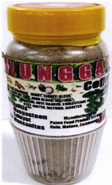
Figure 3. Unregistered MALUNGGAY Coffee