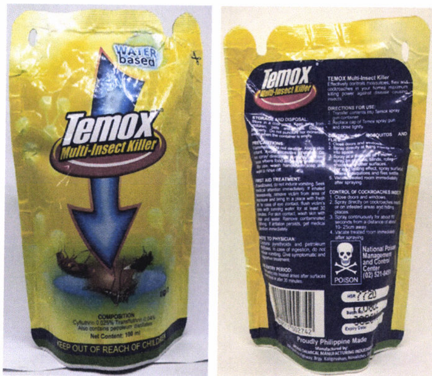
Figure 1. Unregistered Temox Multi-Insect Killer Liquid

The Food and Drug Administration (FDA) warns the public from purchasing and using the following unregistered household urban pesticides: