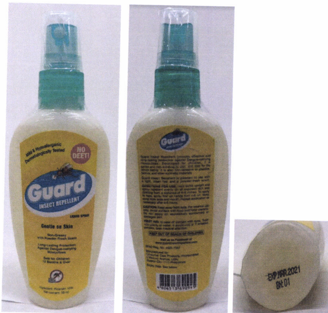
Figure 3. Unregistered Guard Insect Repellent Liquid Spray