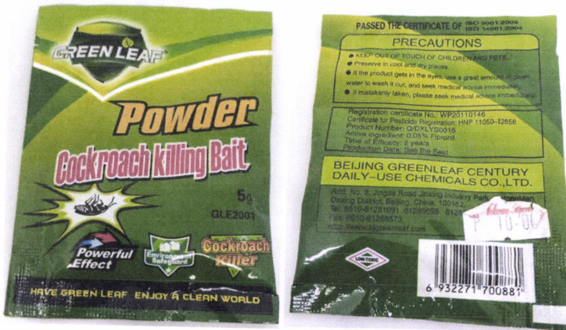
Figure 2. Unregistered Green Leaf Powder Cockroach Killing Bait