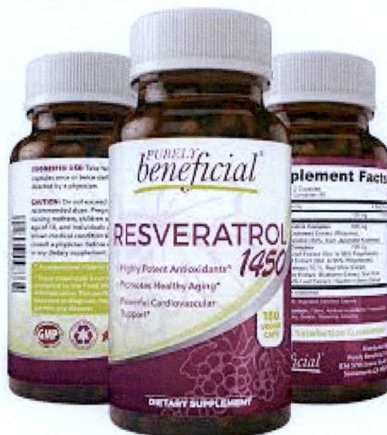
Figure 1. Unregistered PURELY BENEFICIAL Resveratrol 1450 Dietary Supplement, 180 Veggie Caps

The Food and Drug Administration (FDA) warns the public from purchasing and consuming the following unregistered food supplements: