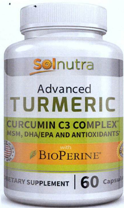
Figure 2. Unregistered SOLNUTRA Advance Turmeric Curcumin C3 Complex MSM, DHA/EPA and Antioxidants with BioPerine Dietary Supplement, 60 Capsules