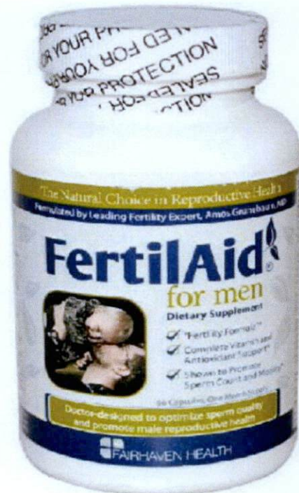
Figure 5. Unregistered FAIRHAVEN HEALTH FertilAid for Men Dietary Supplement, 90 Capsules