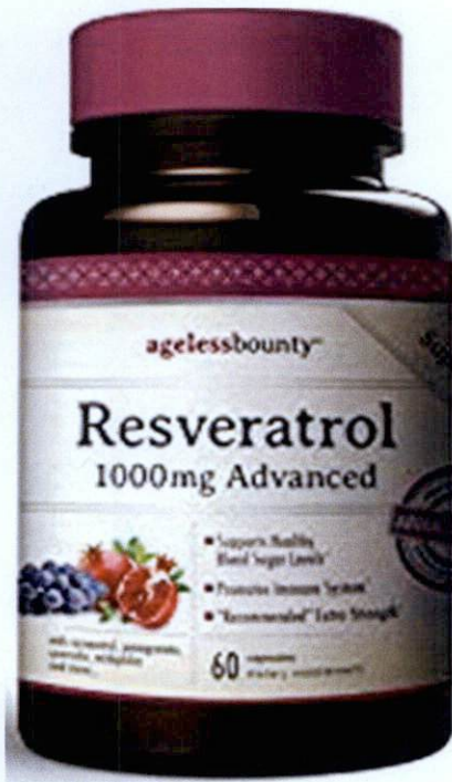
Figure 4. Unregistered AGELESSBOUNTY Resveratrol 1000mg Advance, 60 Capsules