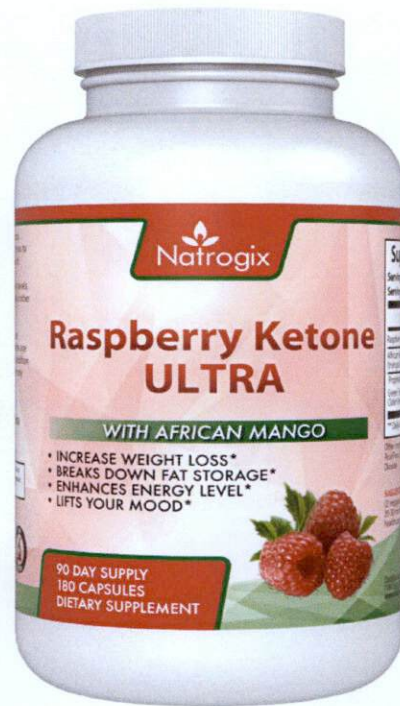
Figure 3. Unregistered NATROGIX Raspberry Ketone Ultra with African Mango Dietary Supplement, 10 Day Supply 180 Capsules