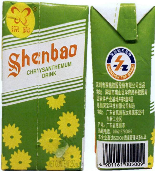
Figure 2. Unregistered SHENBAO Chrysanthemum Drink