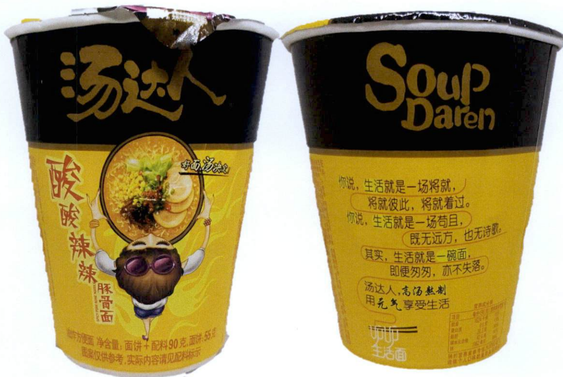
Figure 1. Unregistered SOUP DAREN Spicy Pork Bone Noodle

The Food and Drug Administration (FDA) warns the public from purchasing and consuming the following unregistered food products: