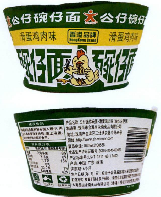
Figure 3. Unregistered DOLL BRAND Bowl Noodle Egg and Chicken Flavor