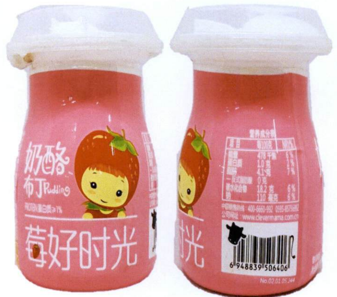
Figure 5. Unregistered CLEVER MAMA Pudding, Strawberry Flavor