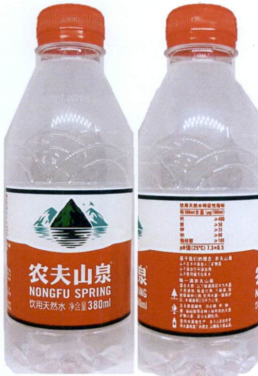
Figure 4. Unregistered NONGFU SPRING Bottled Water