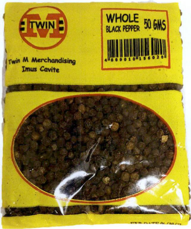
Figure 2. Unregistered TWIN M Whole Black Pepper