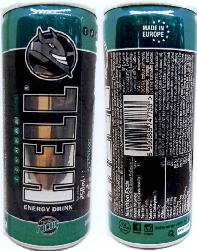
Figure 4. HELL ENERGY DRINK Strong Focus, Functional Drink