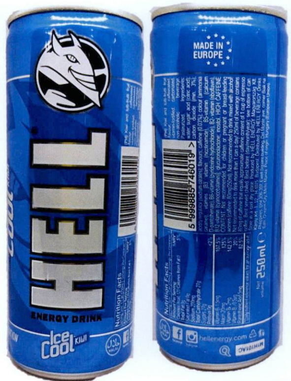
Figure 5. Unregistered HELL Energy Drink Ice Cool Kiwi