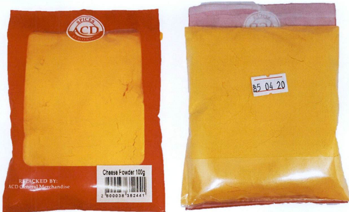
Figure 1. Unregistered ACD SPICES FLAVORINGS, Cheese Powder

The Food and Drug Administration (FDA) warns the public from purchasing and consuming the following unregistered food products: