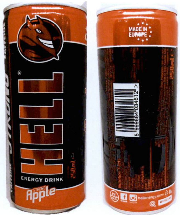
Figure 3. Unregistered HELL Energy Drink Strong Apple