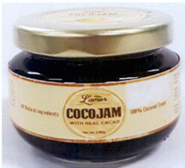
Figure 1. Unregistered L'AMOR Cocojam with Real Cacao, Net Wt. 140g

The Food and Drug Administration (FDA) warns the public from purchasing and consuming the following unregistered food products: