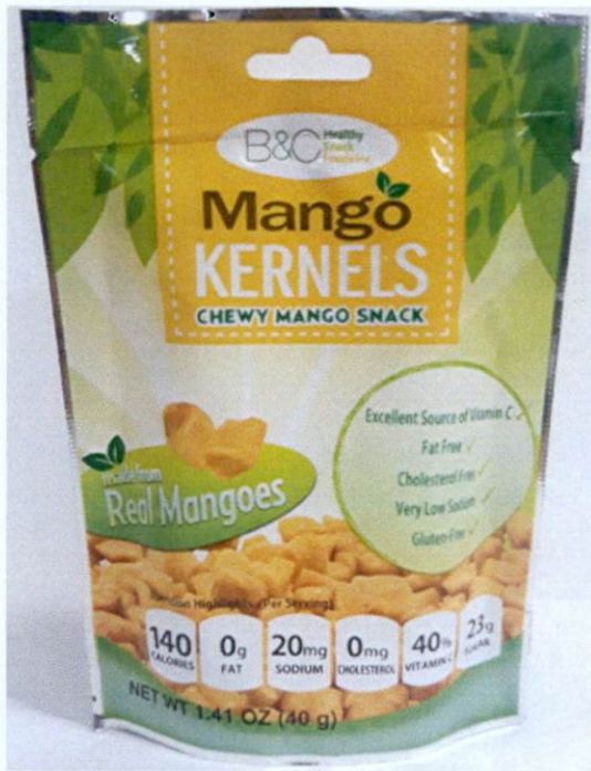
Figure 2. Unregistered B&C Healthy Snack Foods, Inc. Mango Kernels Chewy Mango Snack, Net Wt. 1.41 oz (40g)