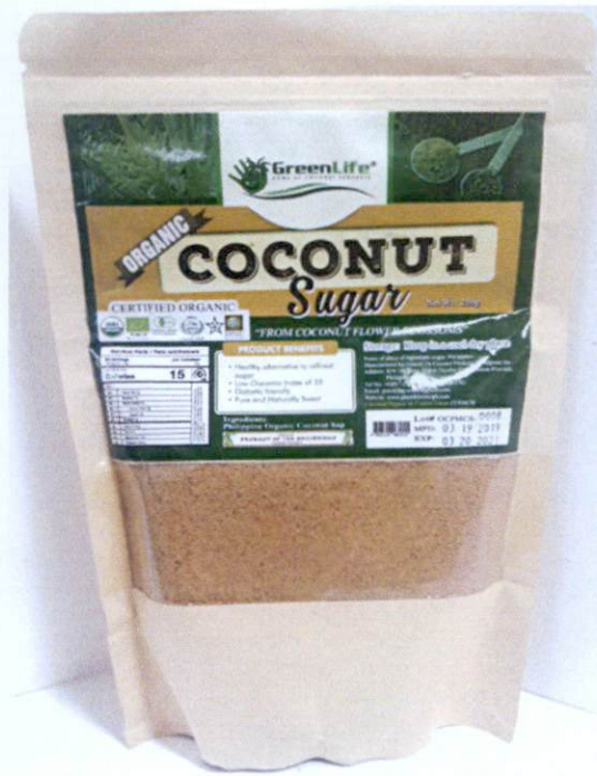
Figure 3. Unregistered GREEN LIFE Organic Coconut Sugar, Net Wt. 250g