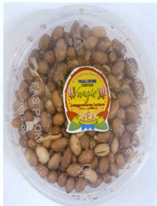
Figure 5. Unregistered EVANGELINA RACASA'S PASALUBONG CENTER VANGIE'S LONGGANISANG LUCBAN, Peanuts