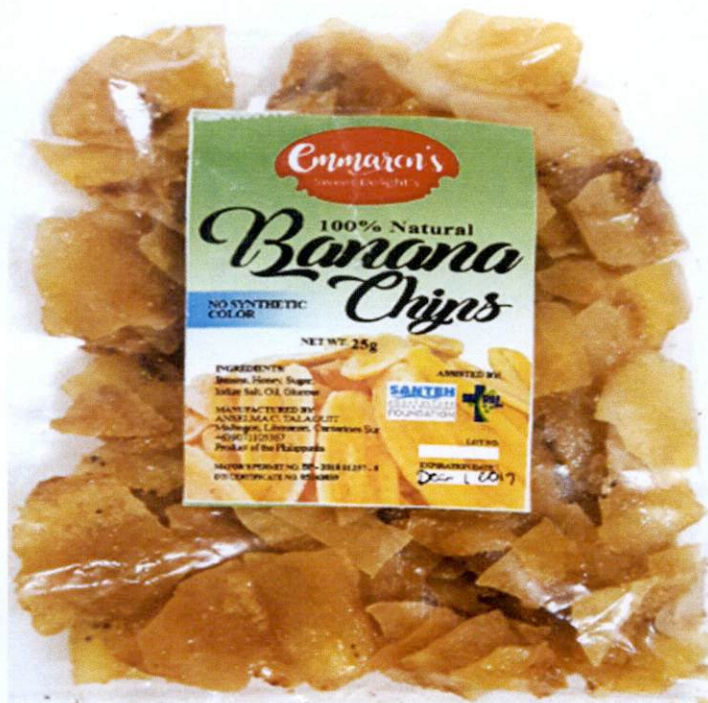
Figure 1. Unregistered EMMARENS Sweet Delights 100% Natural Banana Chips, Net Wt. 25g

The Food and Drug Administration (FDA) warns the public from purchasing and consuming the following unregistered food products: