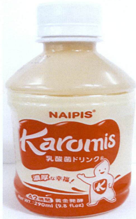
Figure 2. Unregistered NAIPIS Karomis, Net Wt. 290ml (9.8fl. oz)