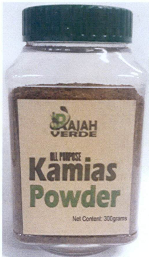
Figure 3. Unregistered RAJAH VERDE All Purpose Kamias Powder, Net Content 300 grams