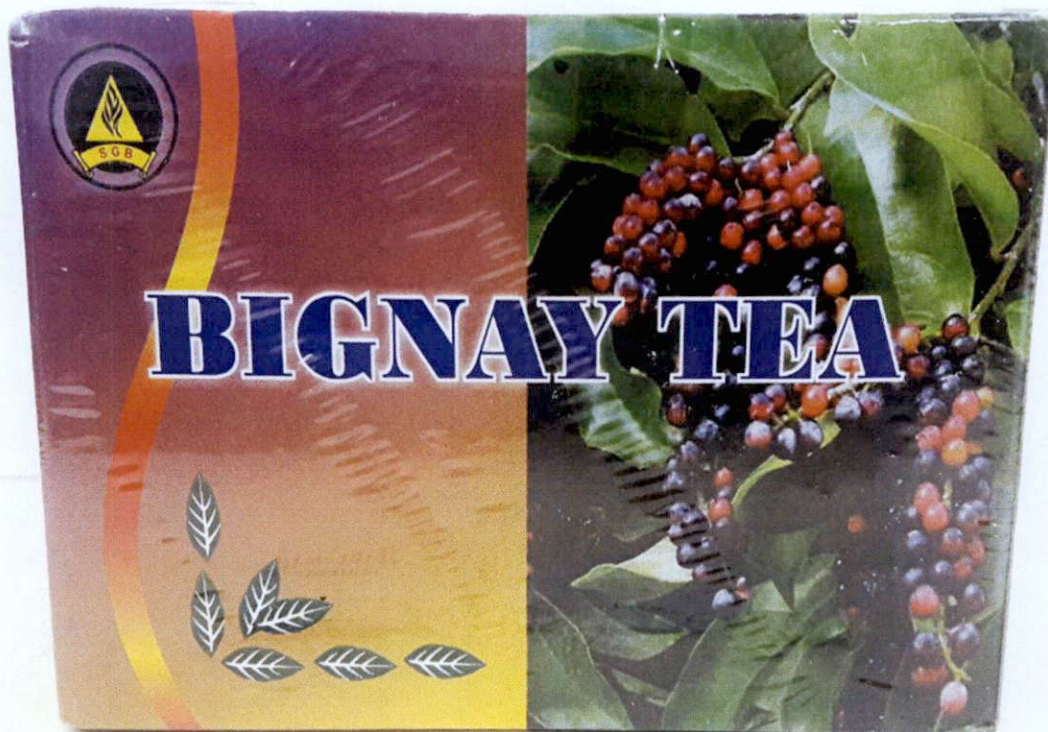
Figure 1. Unregistered SGB Bignay Tea, Net Wt. 25 Tea Bags

The Food and Drug Administration (FDA) warns the public from purchasing and consuming the following unregistered food products: