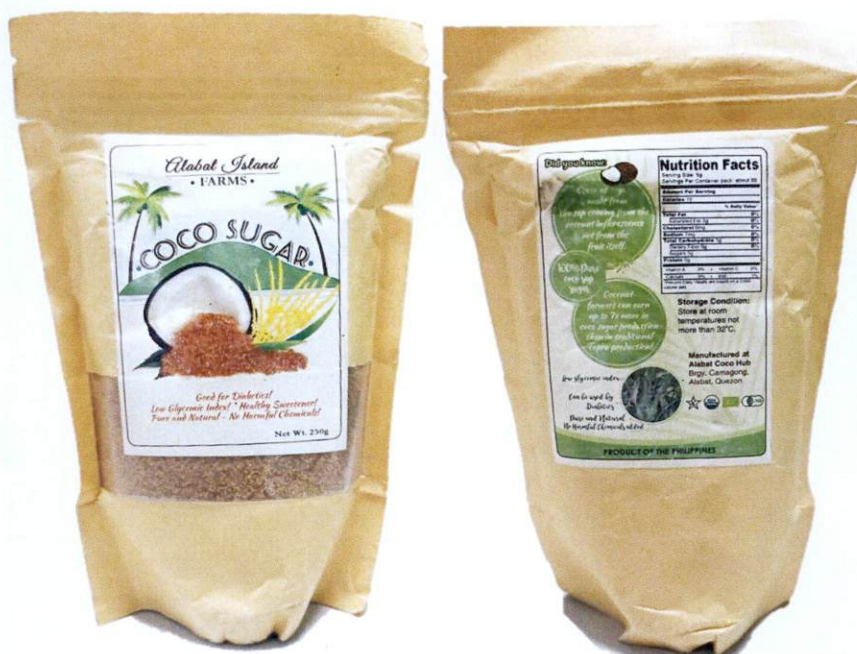
Figure 1. Unregistered ALABAT ISLAND FARMS Coco Sugar

The Food and Drug Administration (FDA) warns the public from purchasing and consuming the following unregistered food products: