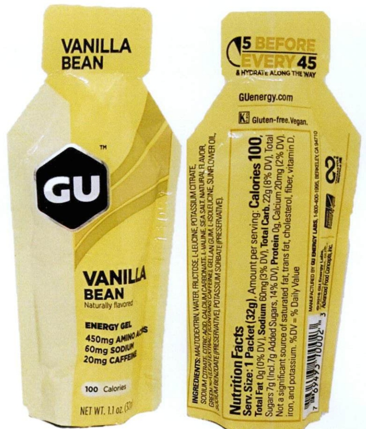
Figure 4. Unregistered GU™ Vanilla Bean, Naturally Flavored Energy Gel