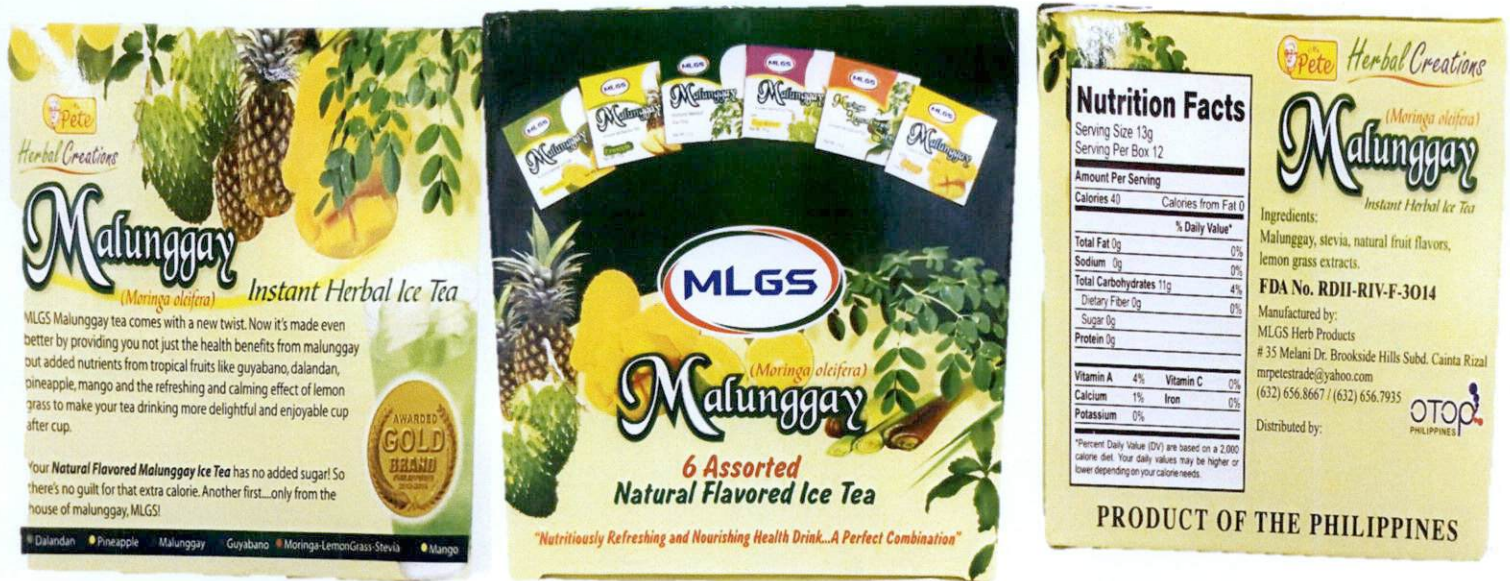
Figure 2. Unregistered MR. PETE Herbal Creations Malunggay 6 Assorted Natural Flavored Iced Tea ( Moringa oleifera )