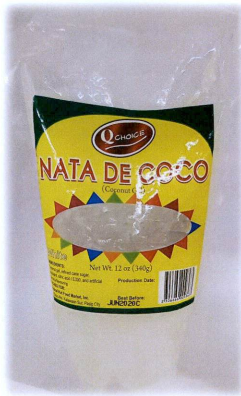
Figure 5. Unregistered Q CHOICE Nata de Coco, Coconut Gel

The FDA verified through post-marketing surveillance that the above mentioned food products are not authorized and the Certificates of Product Registration have not been issued. Pursuant to the Republic Act No. 9711, otherwise known as the “Food and Drug Administration Act of 2009”, the manufacture, importation, exportation, sale, offering for sale, distribution, transfer, non-consumer use, promotion, advertising or sponsorship of health products without the proper authorization is prohibited.