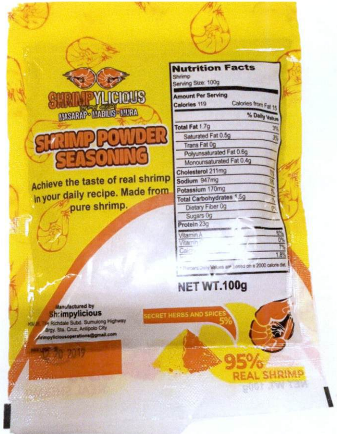
Figure 4. Unregistered SHRIMPYLICIOUS Shrimp Powder Seasoning