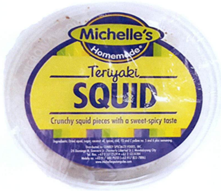
Figure 2. Unregistered MICHELLE'S HOMEMADE Teriyaki Squid