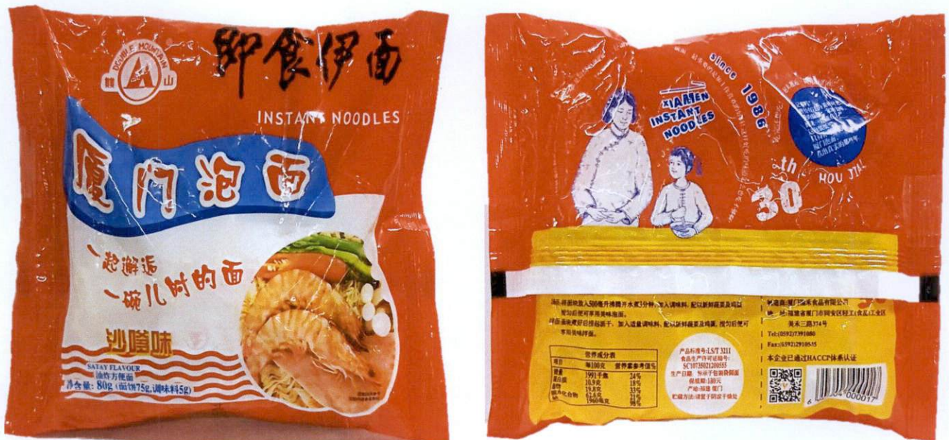
Figure 1. Unregistered DOUBLE MOUNTAIN Instant Noodles, Satay Flavor

The Food and Drug Administration (FDA) warns the public from purchasing and consuming the following unregistered food products: