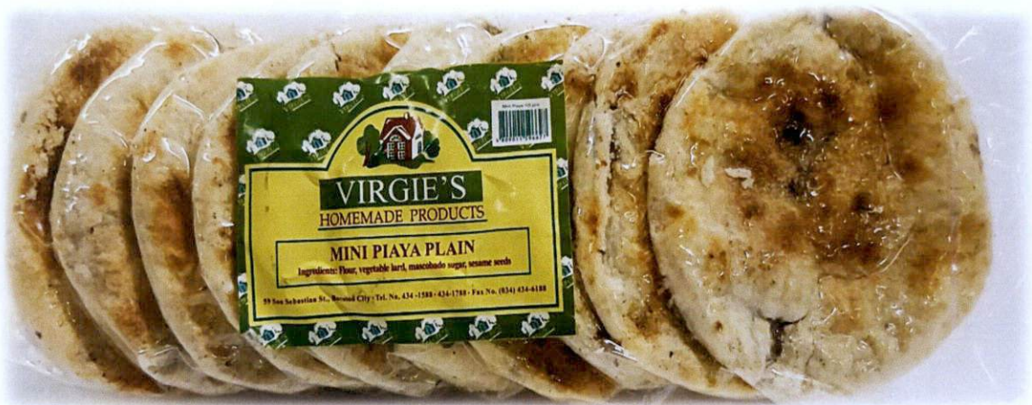
Figure 3. VIRGIE'S HOMEMADE PRODUCTS Mini Piaya Plain