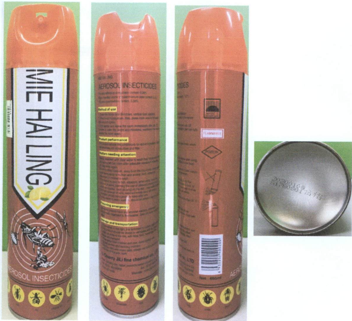
Figure 3. Unregistered Mie Hai Ling Aerosol Insecticide

The FDA verified through post-marketing surveillance that the abovementioned household urban pesticides are not authorized and the Certificates of Product Registration (CPR) have not been issued. Pursuant to the Republic Act No. 9711, otherwise known as the “Food and Drug Administration Act of 2009”, the manufacture, importation, exportation, sale, offering for sale, distribution, transfer, non-consumer use, promotion, advertising or sponsorship of health products without the proper authorization is prohibited.