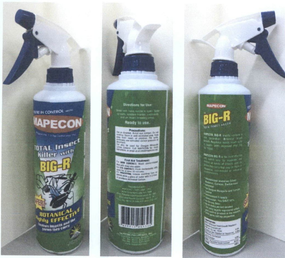
Figure 1. Unregistered Mapecon Total Insect Killer with Big-R Spray

The Food and Drug Administration (FDA) warns the public from purchasing and using the following unregistered household urban pesticides: