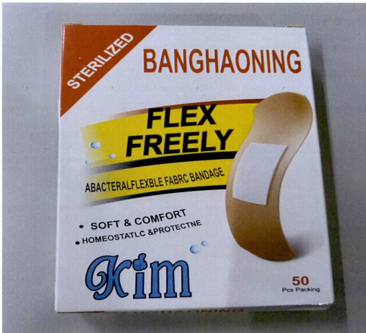
Figure 1. Banghaoning Flex Freely AbacterialFlexible Fabrc Bandage

The Food and Drug Administration (FDA) warns all concerned healthcare professionals and the public against the purchase and use of the unregistered medical device: