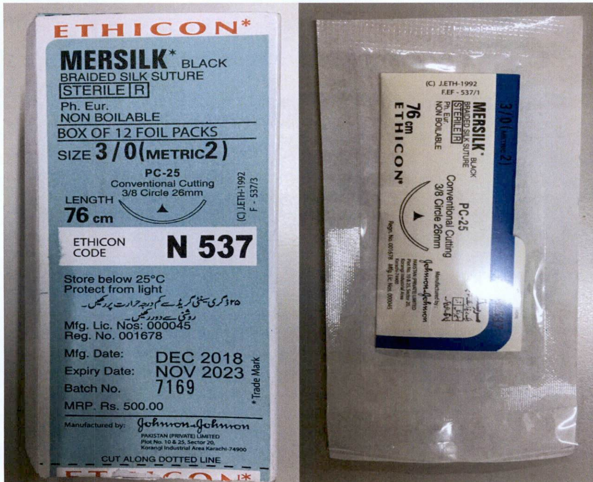
Figure 1. Unregistered Ethicon* Mersilk* Black Braided Silk Suture N537

The Food and Drug Administration (FDA) warns all healthcare professionals and the general public against the purchase and use of the unregistered medical device: