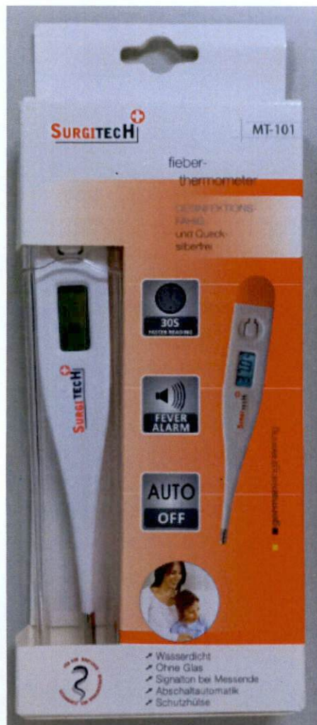
Figure 1. Front label of the unregistered "Surgitech Clinical Fieber Thermometer MT-101"

The Food and Drug Administration (FDA) warns the general public against the purchase and use of the unregistered medical device: