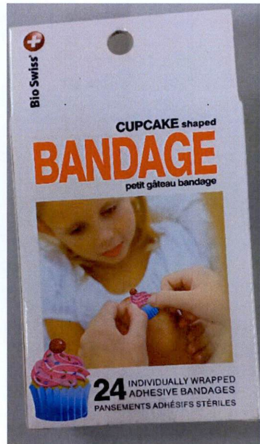
Figure 2. Back label of the unregistered "Bio Swiss Cupcake Shaped Bandage"