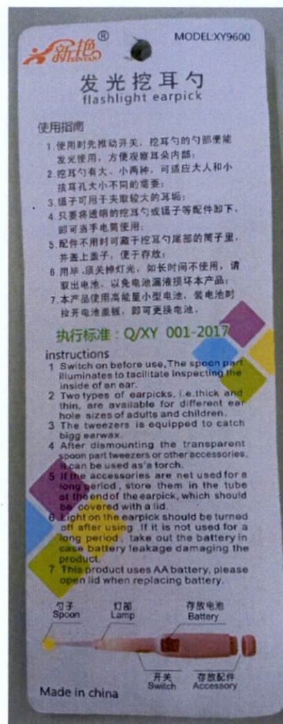
Figure 2. Back label of the unregistered "Flashlight Earpick"