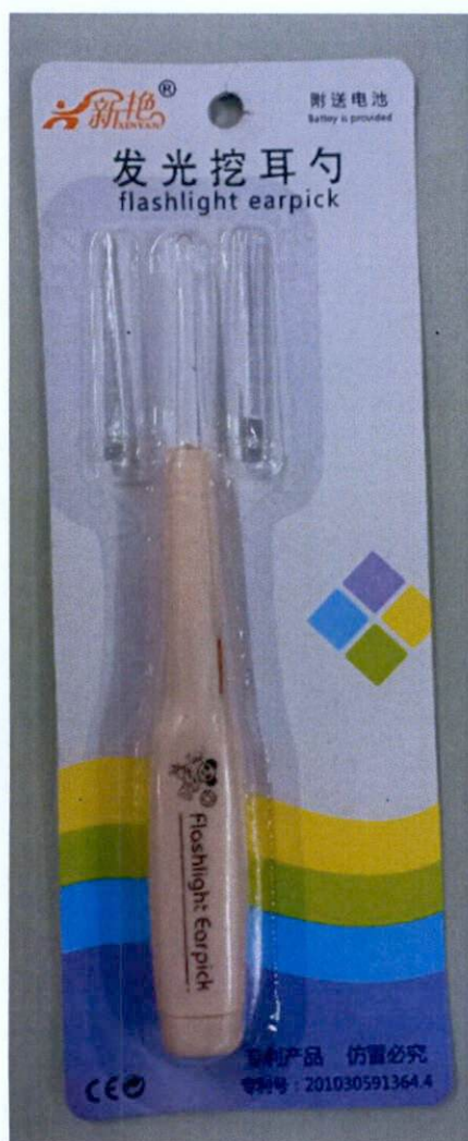
Figure 1. Front label of the unregistered "Flashlight Earpick"

The Food and Drug Administration (FDA) warns the general public against the purchase and use of the unregistered medical device: