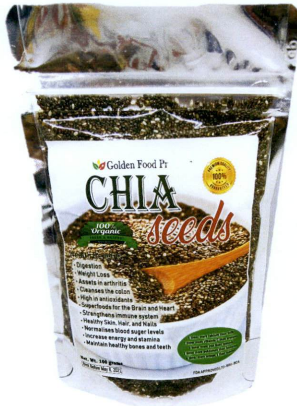
Figure 1. Unregistered GOLDEN FOOD PRODUCTS Chia Seeds (100 grams)

The Food and Drug Administration (FDA) warns the public from purchasing and consuming the following unregistered food products: