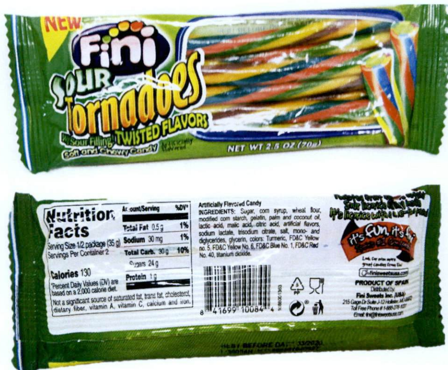
Figure 5. Unregistered FINI Sour Tornadoes with Sour Filling Twisted Flavors Soft and Chewy Candy (70 grams)