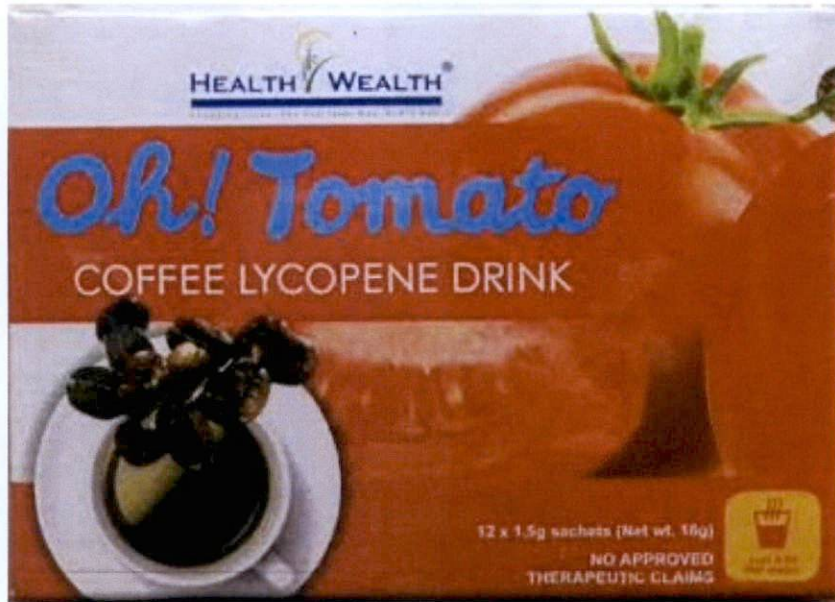
Figure 4. Unregistered HEALTHWEALTH OH! TOMATO Coffee Lycopene Drink