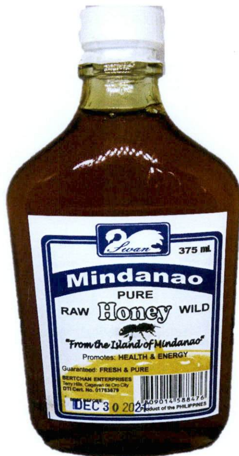
Figure 3. Unregistered SWAN MINDANAO Pure Raw Honey Wild (375 mL)