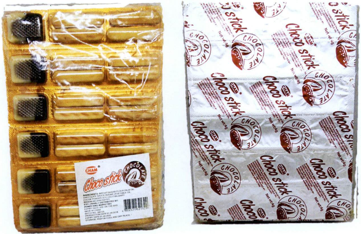
Figure 2. Unregistered CHAM CHOCO STICK (4 grams)