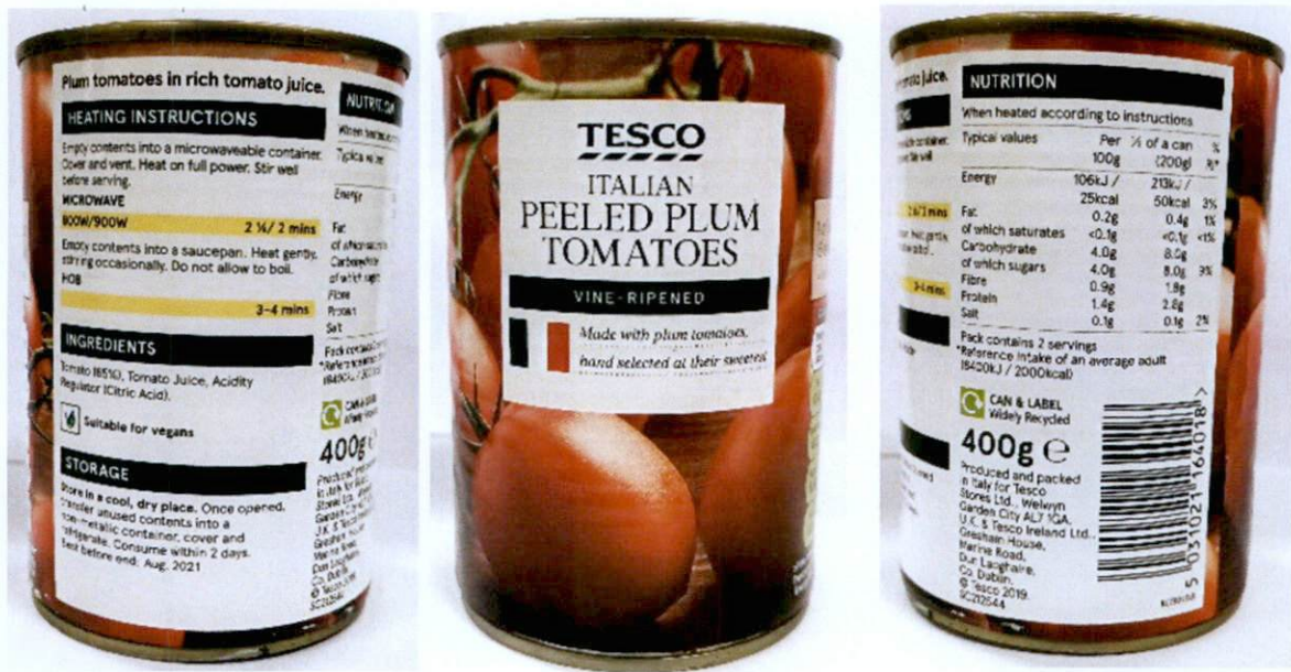
Figure 4. Unregistered TESCO Italian Peeled Plum Tomatoes, Vine-Ripened