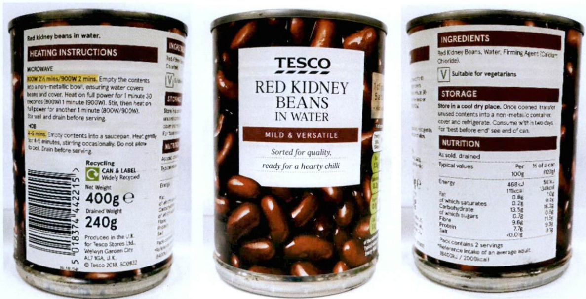
Figure 2. Unregistered TESCO Red Kidney Beans in Water Mild & Versatile