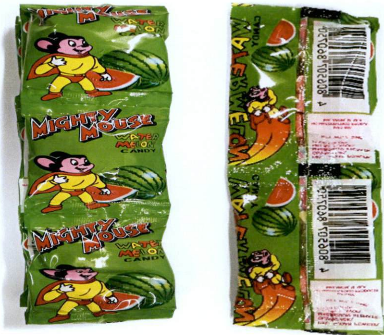
Figure 5. Unregistered MIGHTY MOUSE Watermelon Candy

The FDA verified through post-marketing surveillance that the abovementioned food products are not authorized and the Certificates of Product Registration (CPR) have not been issued. Pursuant to the Republic Act No. 9711, otherwise known as the “Food and Drug Administration Act of 2009”, the manufacture, importation, exportation, sale, offering for sale, distribution,