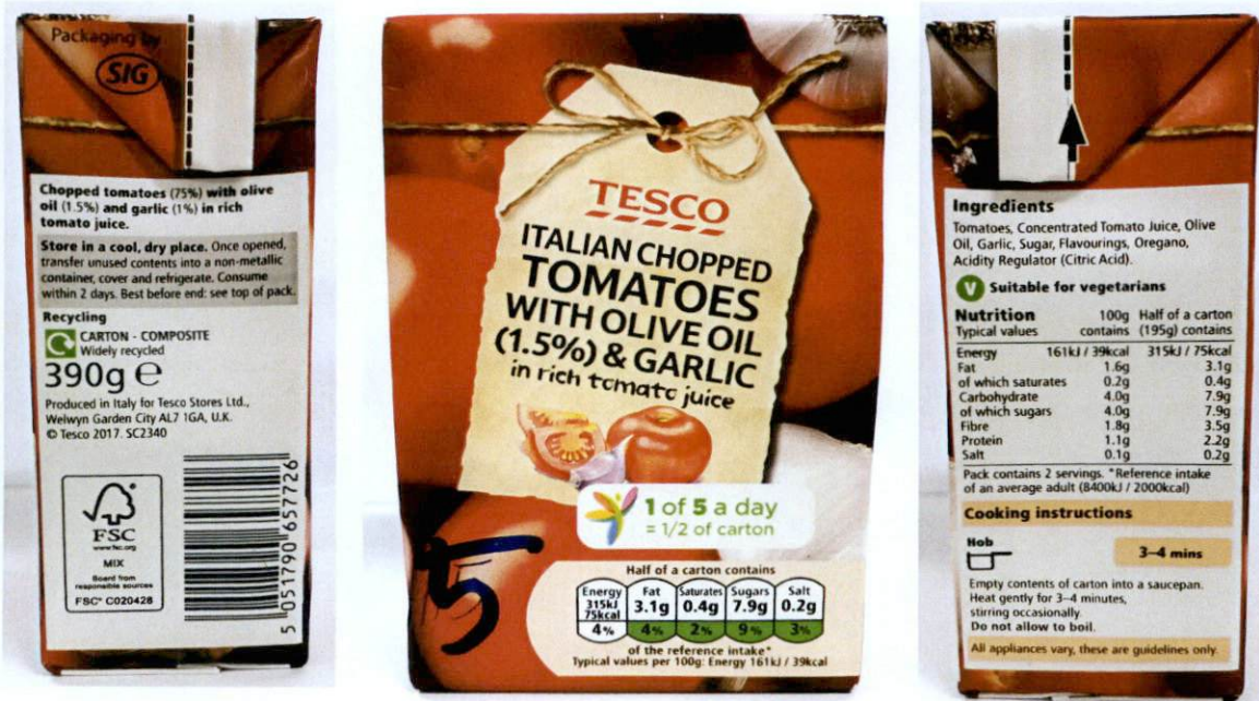
Figure 1. Unregistered TESCO Italian Chopped Tomatoes with Olive Oil (1.5%) & Garlic in rich tomato juice

The Food and Drug Administration (FDA) advises the public from purchasing and consuming the following unregistered food products: