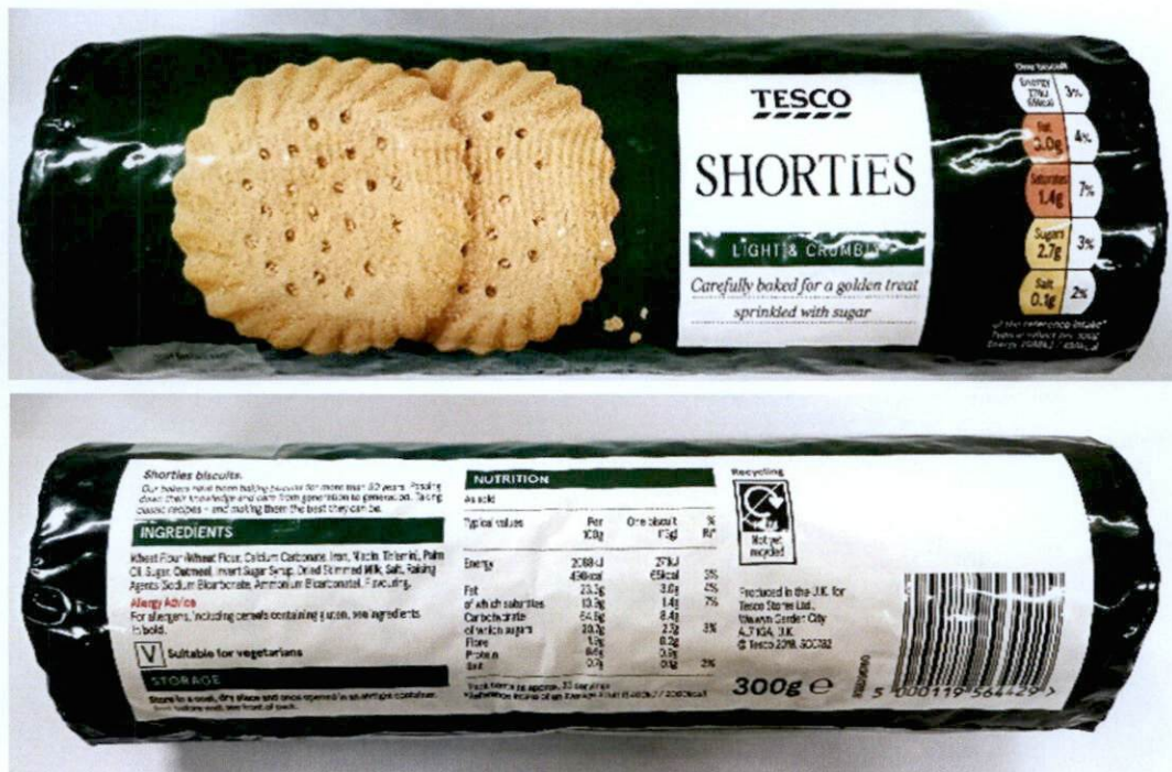
Figure 3. Unregistered TESCO Shorties – Light & Crumbly