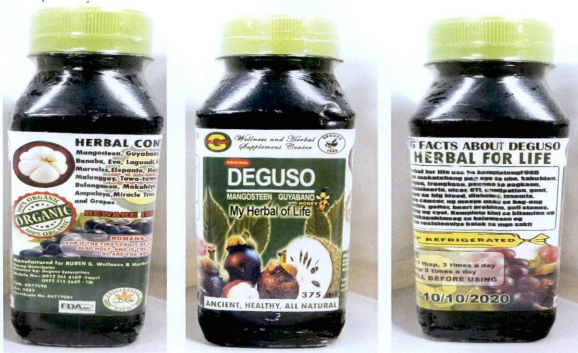
Figure 4. Unregistered DEGUSO Mangosteen Guyabano with Honey

The FDA verified through post-marketing surveillance that the abovementioned food products are not authorized and the Certificates of Product Registration (CPR) have not been issued. Pursuant to the Republic Act No. 9711, otherwise known as the “Food and Drug Administration Act of 2009”, the manufacture, importation, exportation, sale, offering for sale, distribution, transfer, non-consumer use, promotion, advertising or sponsorship of health products without the proper authorization is prohibited.