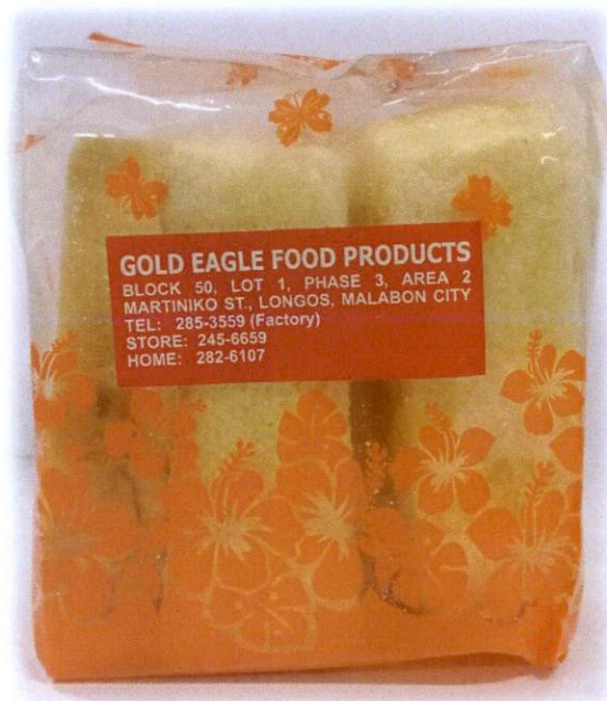
Figure 2. Unregistered GOLD EAGLE Food Product