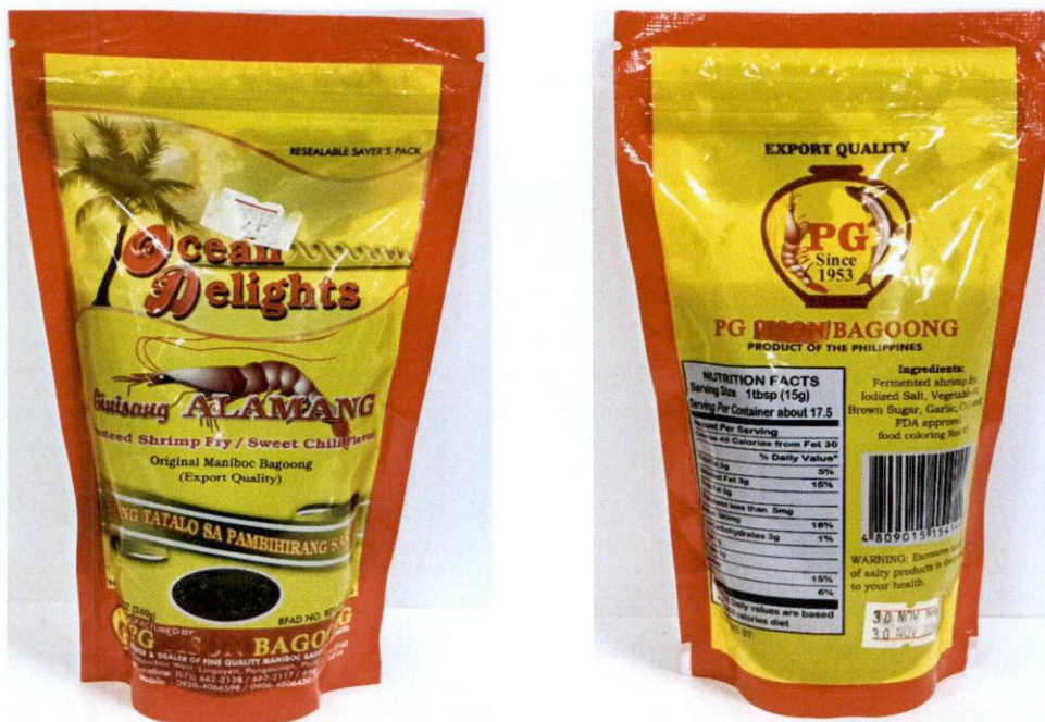
Figure 3. Unregistered OCEAN DELIGHTS Ginisang Alamang (Sauteed Shrimp Fry/ Sweet Chili Flavor)