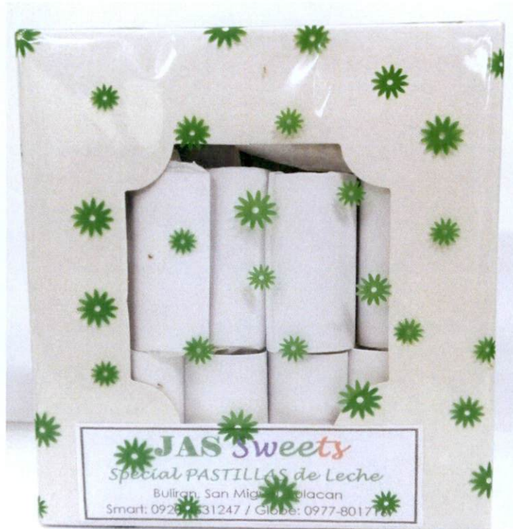
Figure 1. Unregistered JAS SWEETS Special Pastillas de Leche

The Food and Drug Administration (FDA) advises the public from purchasing and consuming the following unregistered food products: