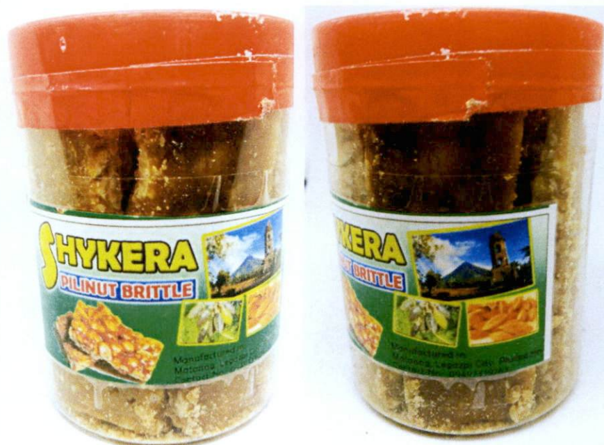
Figure 5. Unregistered SHYKERA Pilinut Brittle