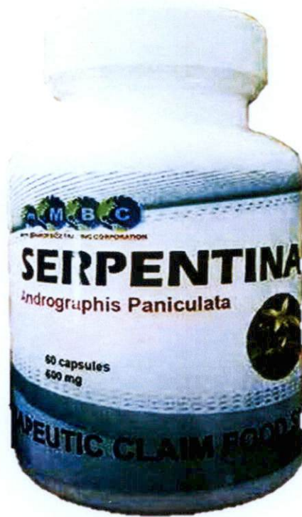
Figure 2. Unregistered M.B.C SERPENTINA Andrographis paniculata (600 mg)