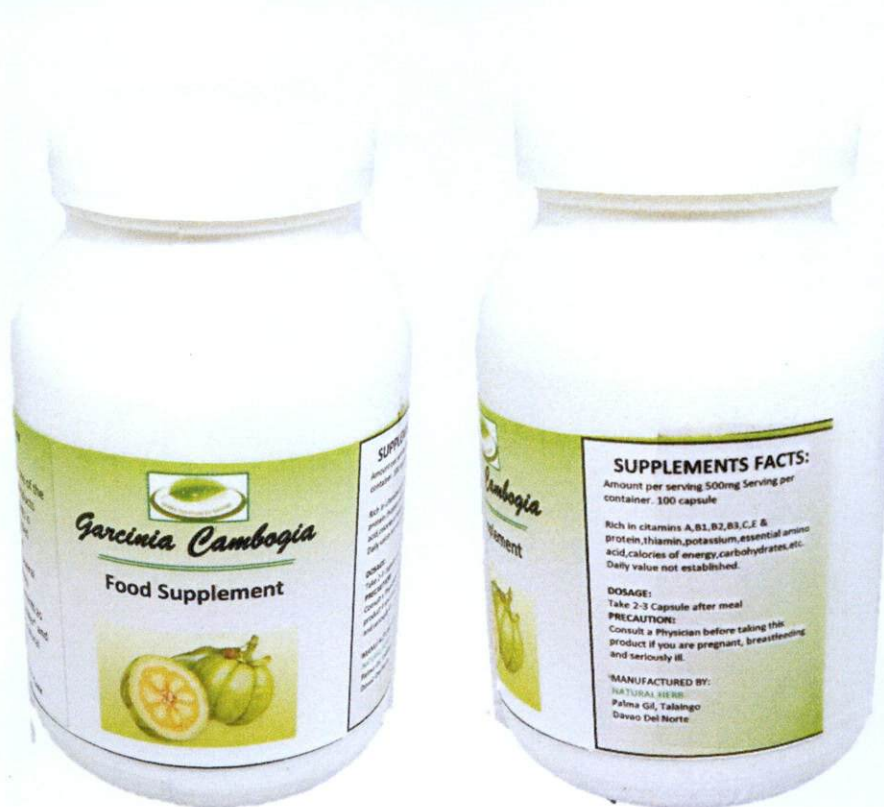
Figure 1. Unregistered GARCINIA CAMBOGIA Food Supplement (100 capsules)

The Food and Drug Administration (FDA) warns the public from purchasing and consuming the following unregistered food products & food supplements: