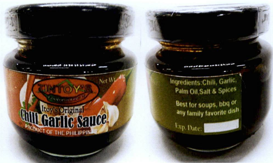
Figure 3. Unregistered TINTOY'S FOOD PRODUCT ITOY'S ORIGINAL Chili Garlic Sauce (4 oz.)