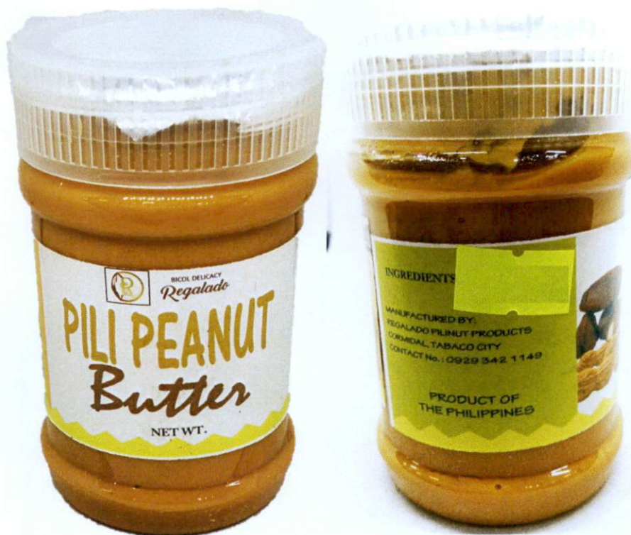
Figure 4. Unregistered BICOL DELICACY REGALADO Pili Peanut Butter