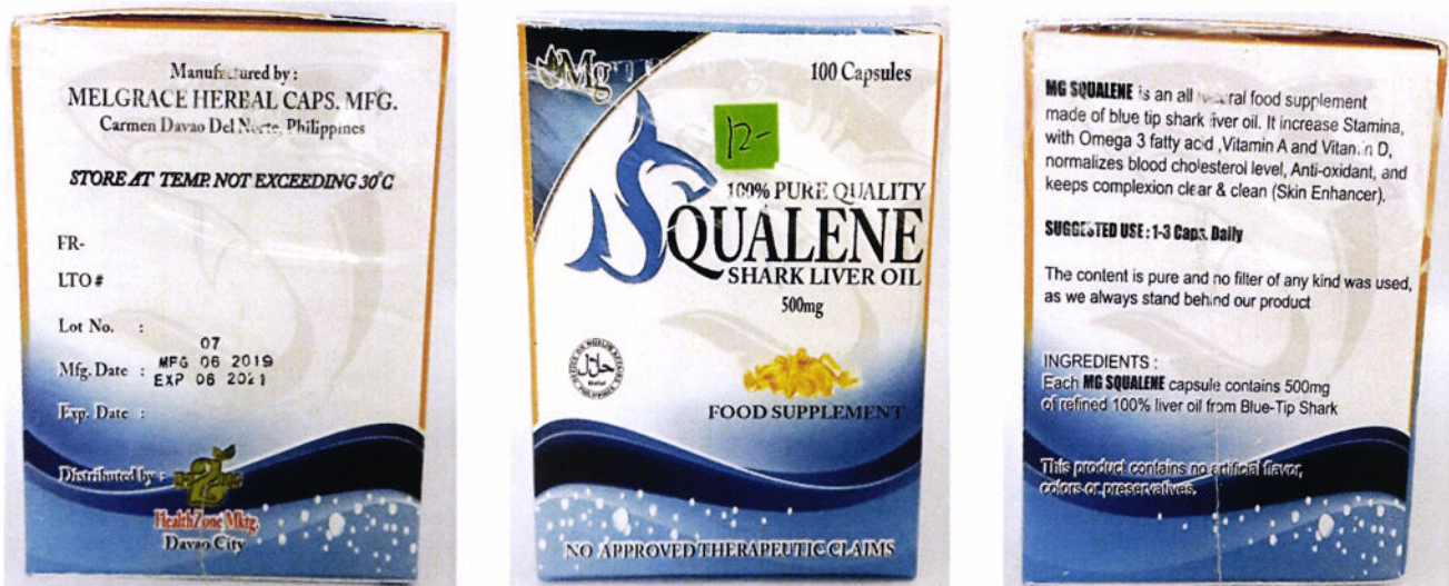
Figure 1. Unregistered SQUALENE Shark Liver Oil 100% pure Quality

The Food and Drug Administration (FDA) warns the public from purchasing and consumption of the following unregistered food supplements: