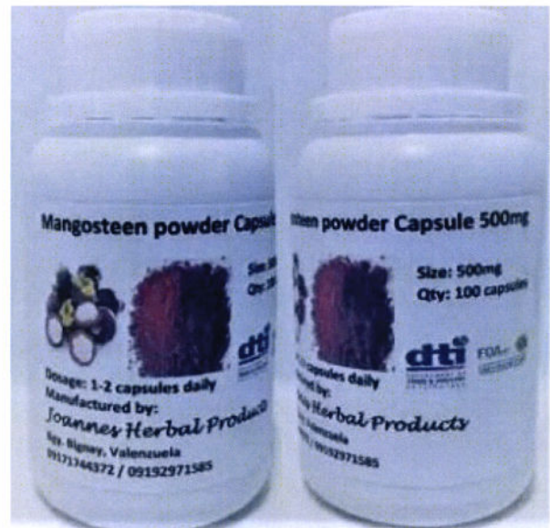
Figure 5. Unregistered Mangosteen Powder Capsule Food Supplement

The FDA verified through post-marketing surveillance that the abovementioned food supplements are not registered and the Certificate of Product Registration (CPR) have not yet been issued. Pursuant to the Republic Act No. 9711, otherwise known as the "Food and Drug Administration Act of 2009", the manufacture, importation, exportation, sale, offering for sale, distribution, transfer, non-consumer use, promotion, advertising or sponsorship of health products without the proper authorization is prohibited.