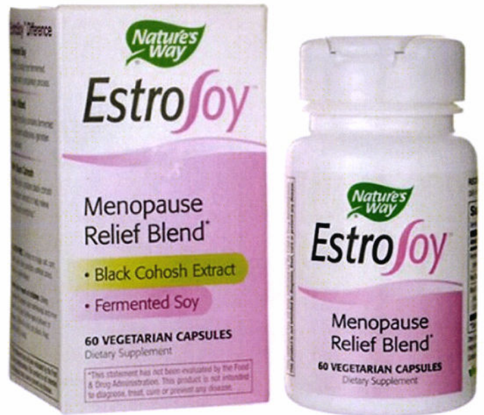
Figure 3. Unregistered NATURE'S WAY EstroSoy Menopause Relief Blend