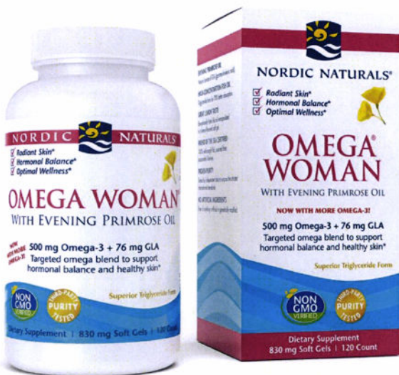
Figure 4. Unregistered NORDIC NATURALS OMEGA WOMAN with Primrose Oil Pack