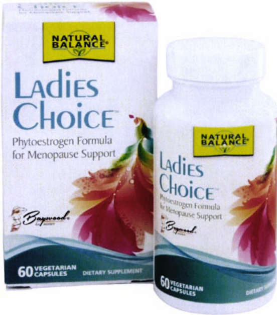
Figure 2. Unregistered NATURAL BALANCE Ladies Choice Phytoestrogen Formula for Menopause Support