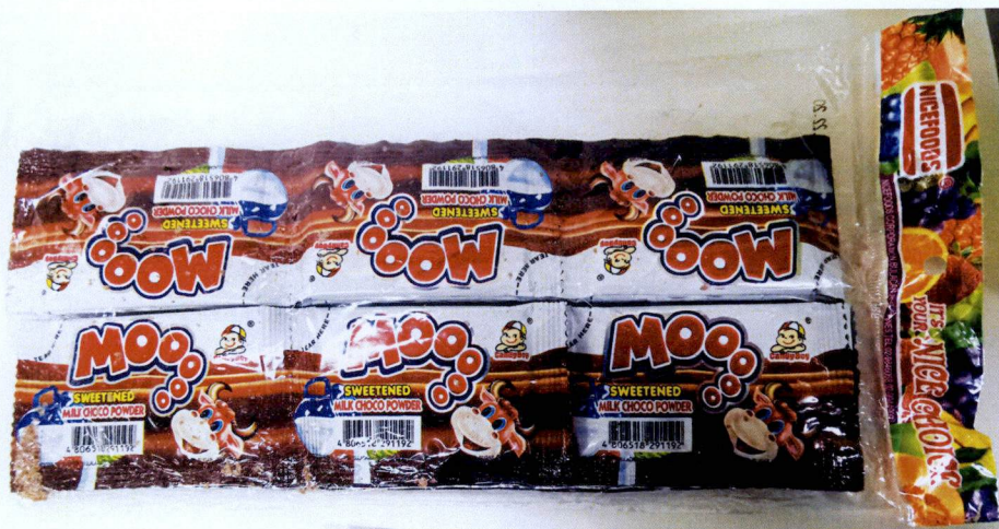
Figure 5. Unregistered CANDY BOY® MOOOOO Sweetened Milk Choco Powder

The FDA verified through post-marketing surveillance that the abovementioned food products are not authorized and the Certificates of Product Registration (CPR) have not been issued. Pursuant to the Republic Act No. 9711, otherwise known as the “Food and Drug Administration Act of 2009”, the manufacture, importation, exportation, sale, offering for sale, distribution, transfer, non-consumer use, promotion, advertising or sponsorship of health products without the proper authorization is prohibited.