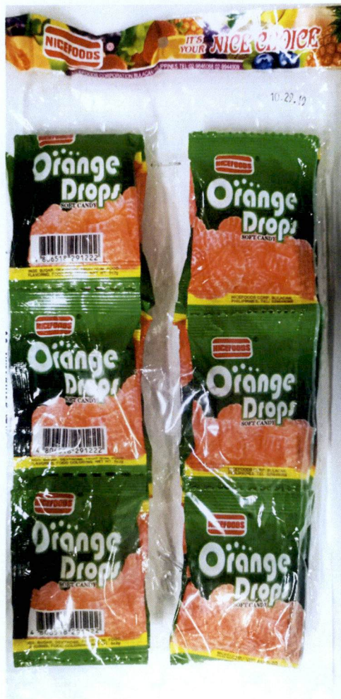
Figure 3. Unregistered NICEFOODS® Orange Drops Soft Candy