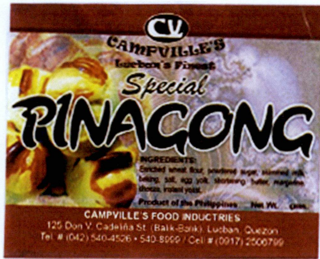
Figure 2. Unregistered CV CAMPVILLE'S Special Pinagong