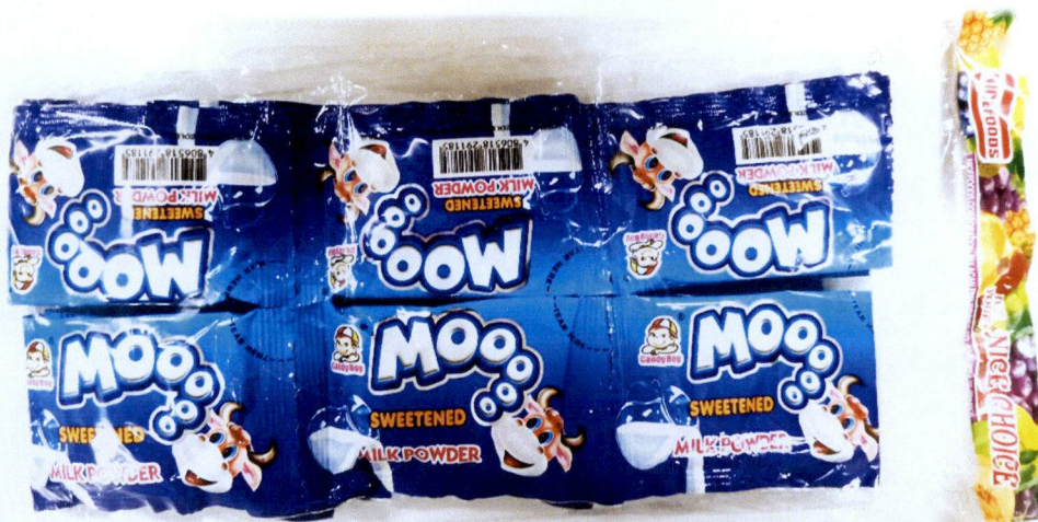
Figure 4. Unregistered CANDY BOY® MOOOOO Sweetened Milk Powder