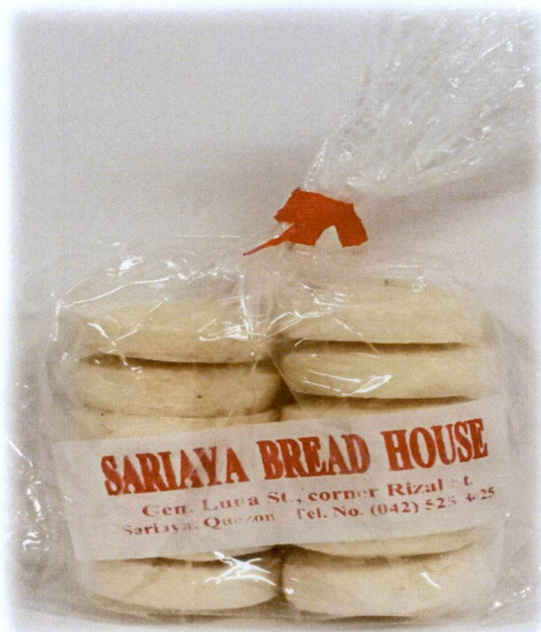
Figure 3. Unregistered SARIAYA BREAD HOUSE Puto Seko