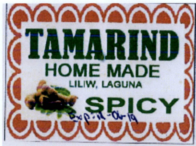
Figure 5. Unregistered HOME MADE Tamarind Spicy

The FDA verified through post-marketing surveillance that the abovementioned food products are not authorized and the Certificates of Product Registration (CPR) have not been issued. Pursuant to the Republic Act No. 9711, otherwise known as the “Food and Drug Administration Act of 2009”, the manufacture, importation, exportation, sale, offering for sale, distribution, transfer, non-consumer use, promotion, advertising or sponsorship of health products without the proper authorization is prohibited.