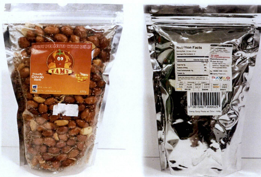
Figure 1. Unregistered YAMY Spicy Peanut with Dilis

The Food and Drug Administration (FDA) advises the public from purchasing and consuming the following unregistered food products: