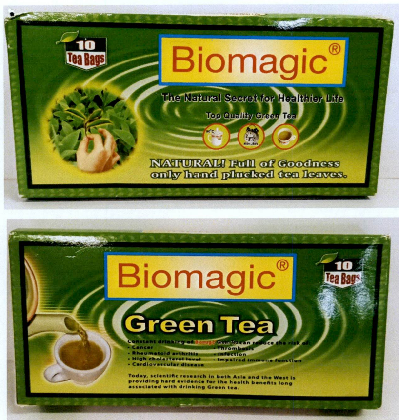
Figure 2. Unregistered BIOMAGIC® Green Tea