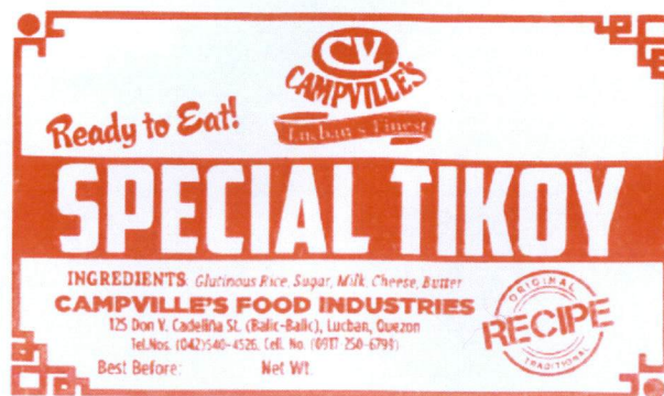
Figure 4. Unregistered CV CAMPVILLE'S Special Tikoy