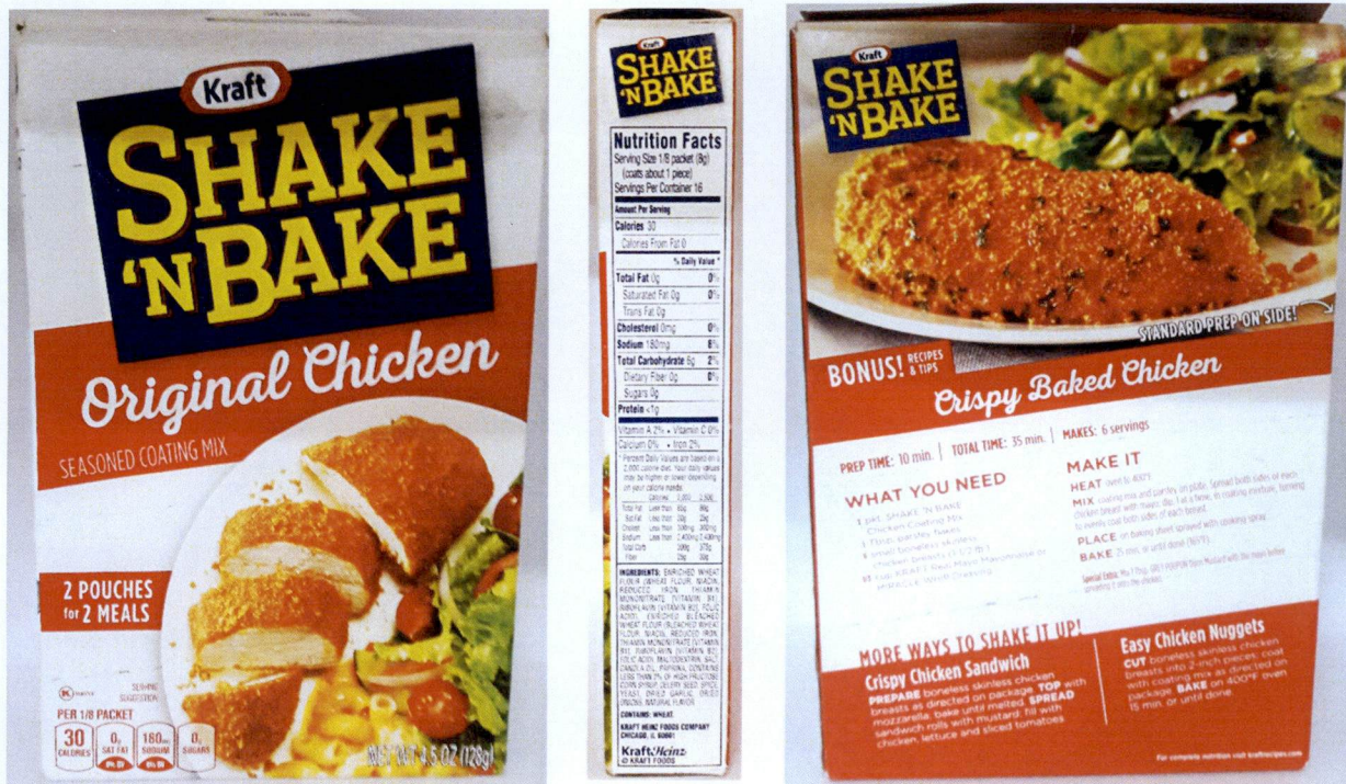
Figure 1. Unregistered KRAFT Shake 'N Bake Original Chicken Seasoned Coating Mix

The Food and Drug Administration (FDA) warns the public from purchasing and consumption of the following unregistered food product and food supplements: