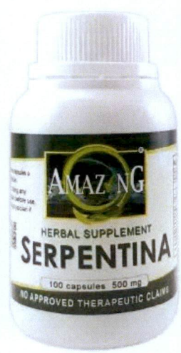
Figure 5. Unregistered AMAZING Serpentina Food Supplement

The FDA verified through post-marketing surveillance that the abovementioned food product and food supplements are not registered and the Certificate of Product Registration (CPR) have not yet been issued. Pursuant to the Republic Act No. 9711, otherwise known as the “Food and Drug Administration Act of 2009”, the manufacture, importation, exportation, sale, offering for sale, distribution, transfer, non-consumer use, promotion, advertising or sponsorship of health products without the proper authorization is prohibited.