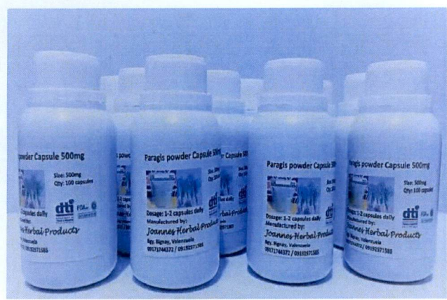
Figure 4. Unregistered PARAGIS Powder Capsule