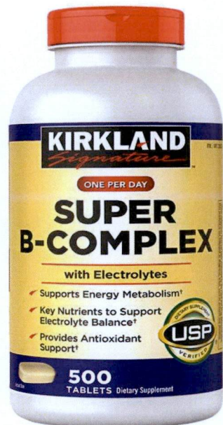
Figure 3. Unregistered KIRKLAND Signature Super B-Complex with Electrolytes