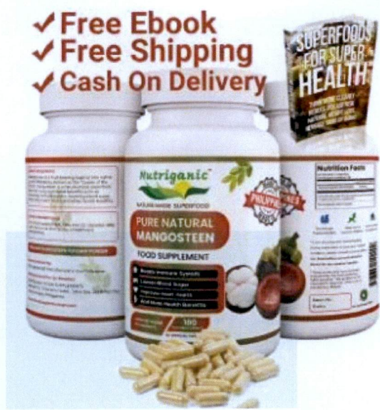
Figure 2. Unregistered NUTRIGANIC Mangosteen Vegetarian Capsules