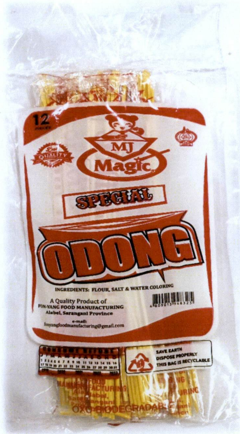
Figure 4. Unregistered MJ MAGIC Special Odong