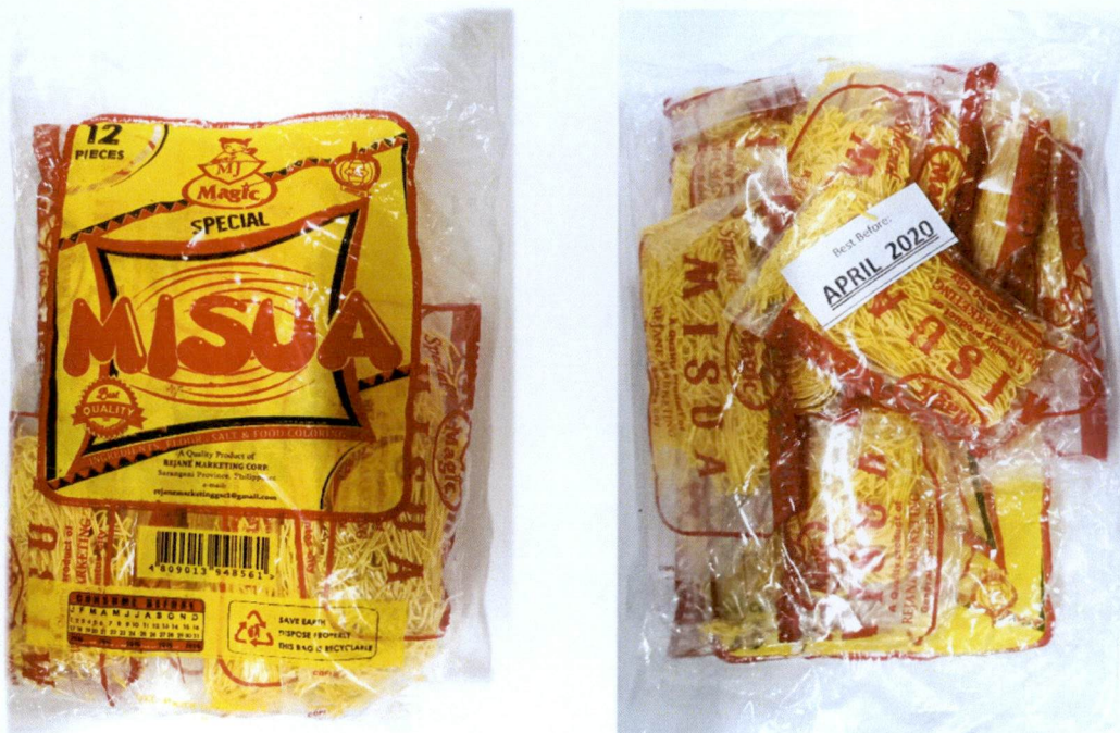
Figure 3. Unregistered MJ MAGIC Special Misua