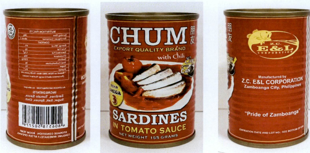
Figure 5. Unregistered CHUM SARDINES in Tomato Sauce with Chili

The FDA verified through post-marketing surveillance that the abovementioned food products are not authorized and the Certificates of Product Registration (CPR) have not been issued. Pursuant to the Republic Act No. 9711, otherwise known as the “Food and Drug Administration