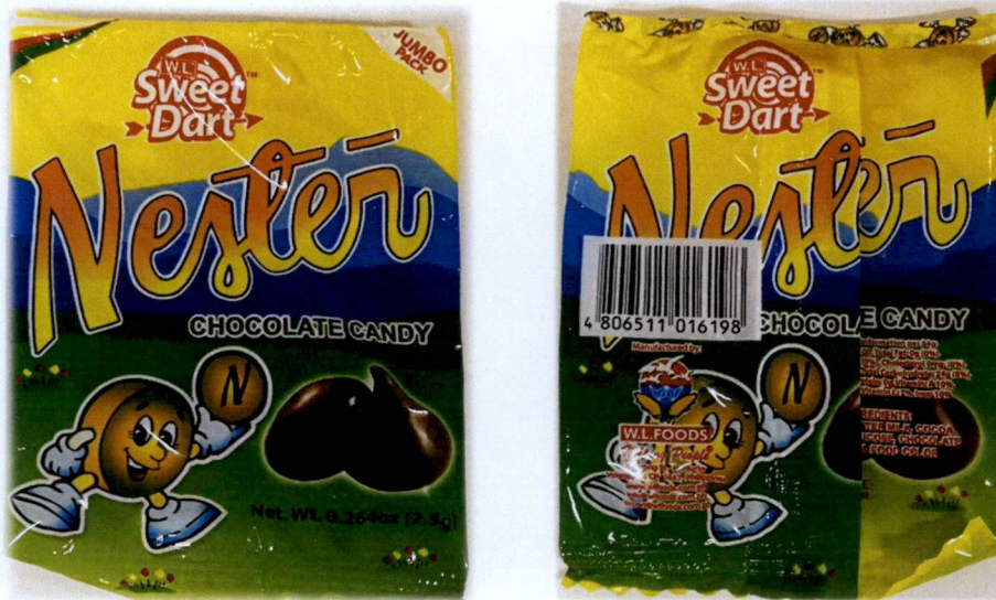
Figure 1. Unregistered W.L. TM SWEET DART TM Nester Chocolate Candy

The Food and Drug Administration (FDA) advises the public from purchasing and consuming the following unregistered food products: