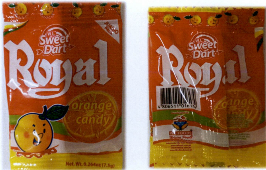
Figure 2. Unregistered W.L. TM SWEET DART TM Royal Orange Candy