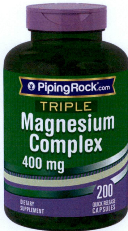
Figure 2. Unregistered PIPING ROCK Triple Magnesium Complex Capsules