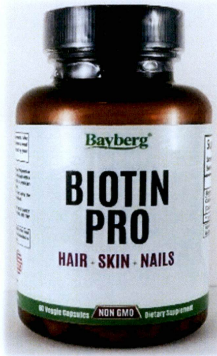
Figure 1. Unregistered BAYBERG Biotin Pro Dietary Supplement

The Food and Drug Administration (FDA) advises the public from purchasing and consuming the following unregistered food supplements: