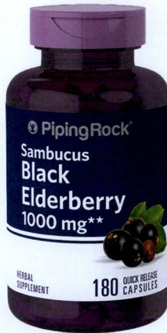
Figure 4. Unregistered PIPING ROCK Black Elderberry Sambucus Dietary Supplement