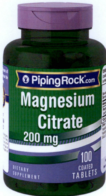
Figure 3. Unregistered PIPING ROCK Magnesium Citrate Coated Caplets