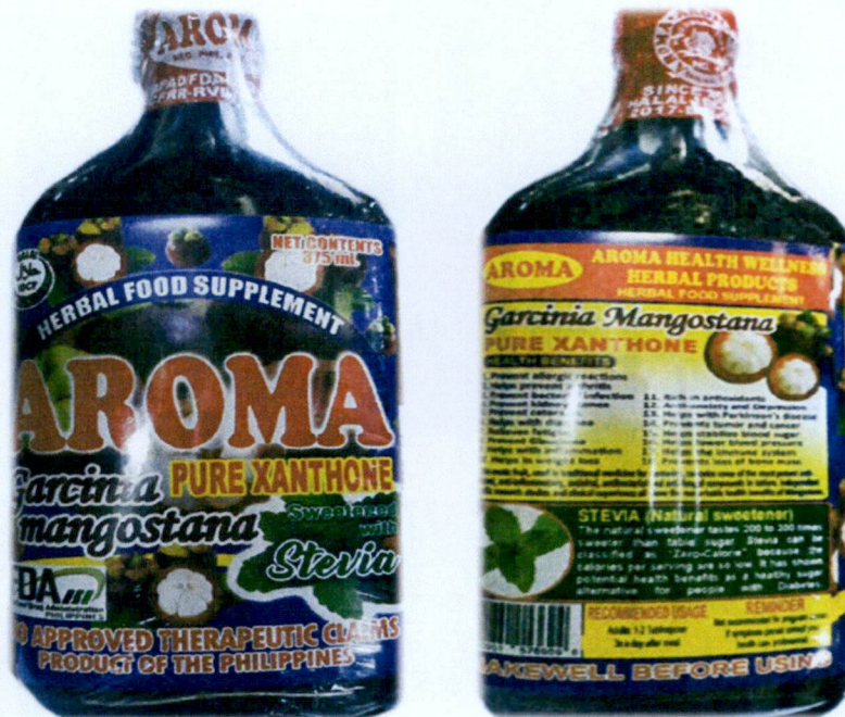
Figure 1. Unregistered AROMA PURE XANTHONE Garcinia Mangostana Sweetened with Stevia Herbal Food Supplement

The Food and Drug Administration (FDA) advises the public from purchasing and consuming the following unregistered food supplements: