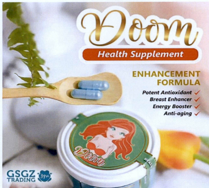
Figure 3. Unregistered DOOM Enhancement Formula Health Supplement