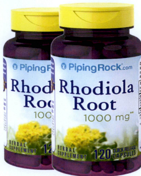
Figure 4. Unregistered PIPING ROCK Rhodiola Root Dietary Supplement