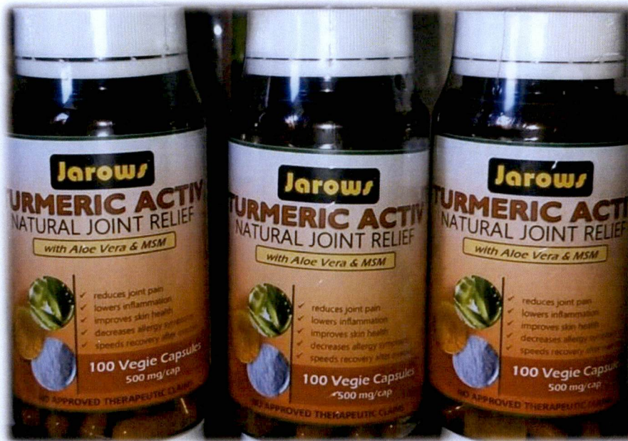
Figure 2. Unregistered JAROWS Turmeric Active with Aloe Vera & MSM Food Supplement