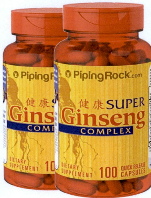
Figure 3. Unregistered PIPING ROCK Super Ginseng Complex Dietary Supplement