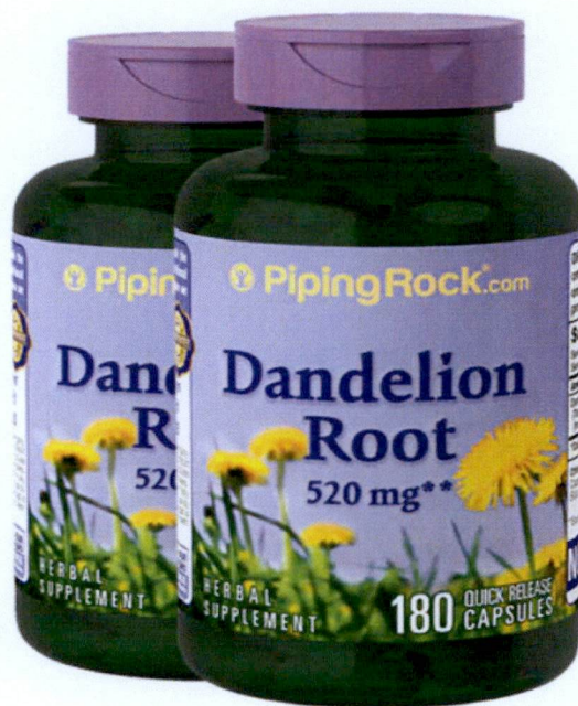
Figure 5. Unregistered PIPING ROCK Dandelion Root Herbal Supplement

The FDA verified through post-marketing surveillance that the abovementioned food supplements are not authorized and the Certificates of Product Registration (CPR) have not been issued. Pursuant to the Republic Act No. 9711, otherwise known as the “Food and Drug Administration Act of 2009”, the manufacture, importation, exportation, sale, offering for sale,