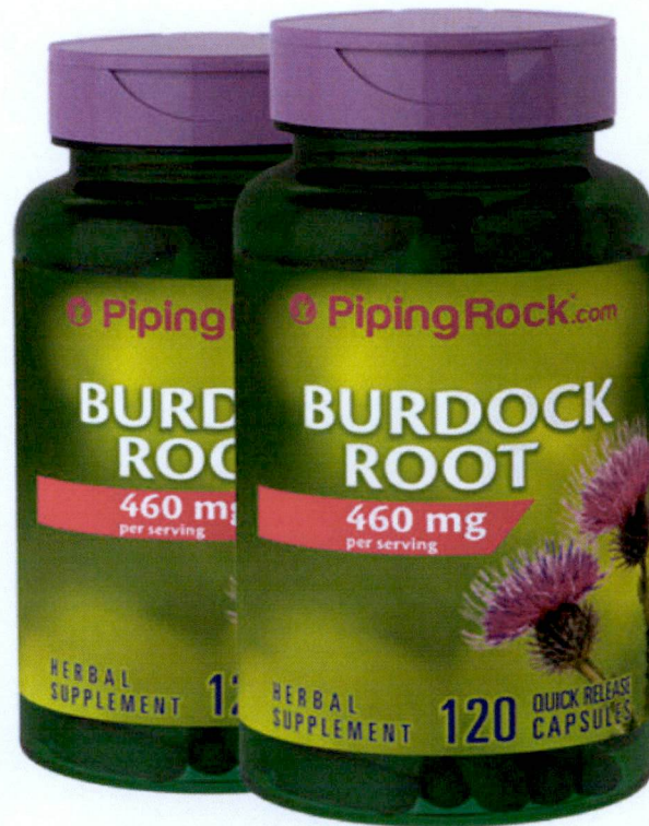
Figure 2. Unregistered PIPING ROCK Burdock Root Herbal Supplement