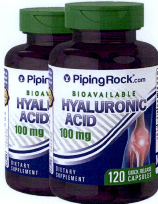
Figure 1. Unregistered PIPING ROCK H-Joint Hyaluronic Acid Dietary Supplement

The Food and Drug Administration (FDA) advises the public from purchasing and consuming the following unregistered food supplements: