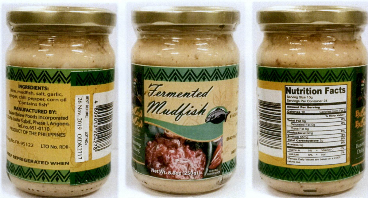
Figure 5. Unregistered BALAW BALAW THE ART OF FLAVORS Burong Dalag (Fermented Mudfish)

The FDA verified through post-marketing surveillance that the abovementioned food products are not authorized and the Certificates of Product Registration (CPR) have not been issued. Pursuant to the Republic Act No. 9711, otherwise known as the “Food and Drug Administration Act of 2009”, the manufacture, importation, exportation, sale, offering for sale, distribution,