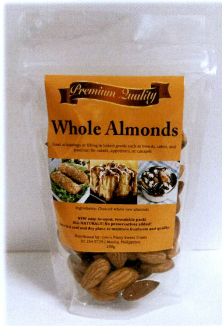
Figure 4. Unregistered PREMIUM QUALITY Whole Almonds