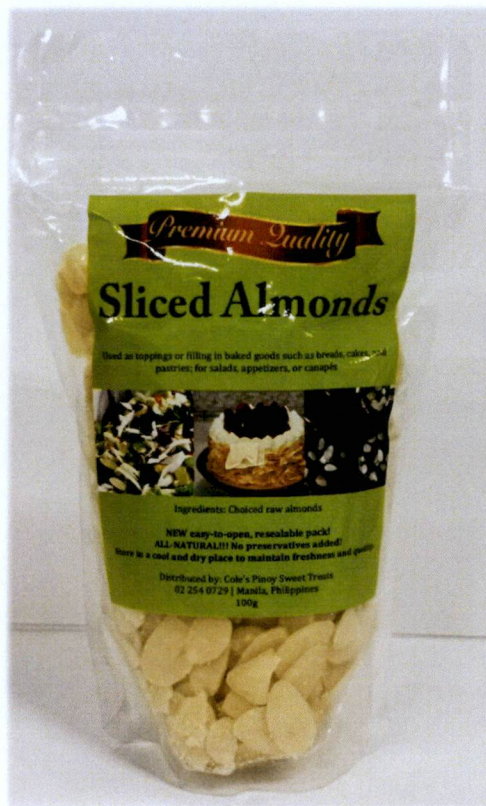
Figure 3. Unregistered PREMIUM QUALITY Sliced Almonds