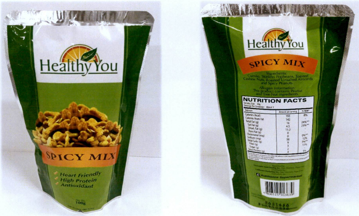
Figure 2. Unregistered HEALTHY YOU Spicy Mix