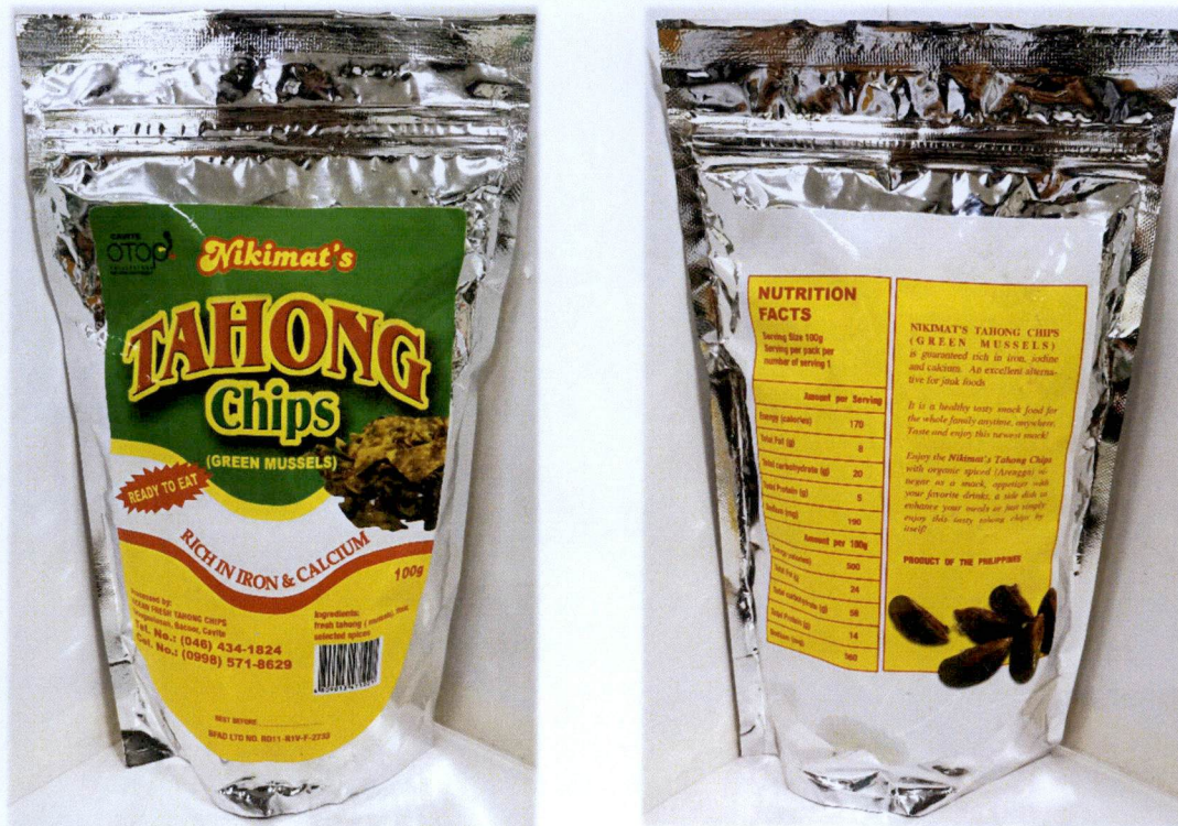
Figure 1. Unregistered NIKIMAT'S Tahong Chips

The Food and Drug Administration (FDA) advises the public from purchasing and consuming the following unregistered food products: