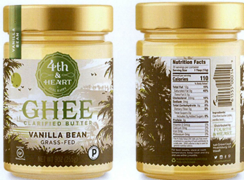
Figure 3. Unregistered 4th & HEART Vanilla Bean Grass Fed Ghee Butter