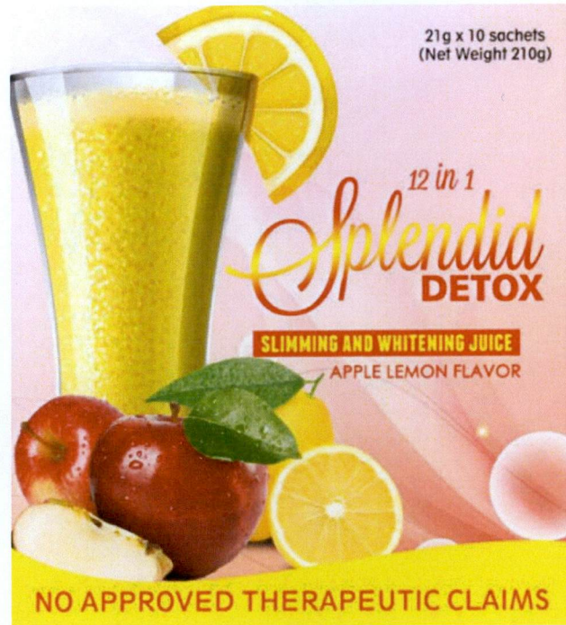
Figure 2. Unregistered 12 in 1 SPLENDID DETOX Apple Lemon Flavor