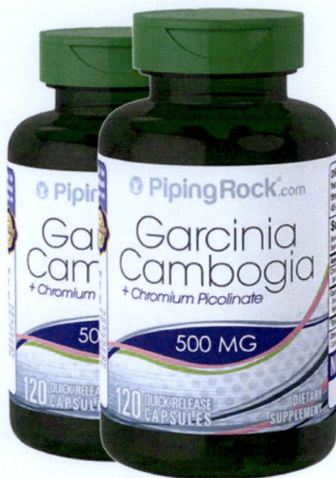
Figure 5. Unregistered PIPING ROCK Garcinia Cambogia + Chromium Picolinate Dietary Supplement

The FDA verified through post-marketing surveillance that the abovementioned food products and food supplements are not authorized and the Certificates of Product Registration (CPR) have not been issued. Pursuant to the Republic Act No. 9711, otherwise known as the “Food and Drug Administration Act of 2009”, the manufacture, importation, exportation, sale, offering for sale,