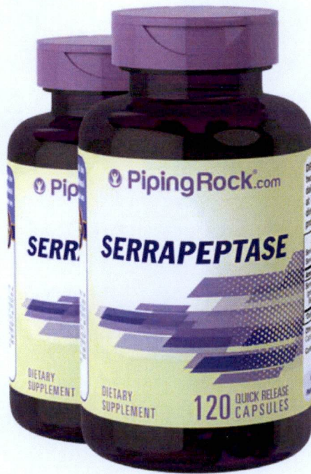
Figure 4. Unregistered PIPING ROCK Serrapeptase Dietary Supplement