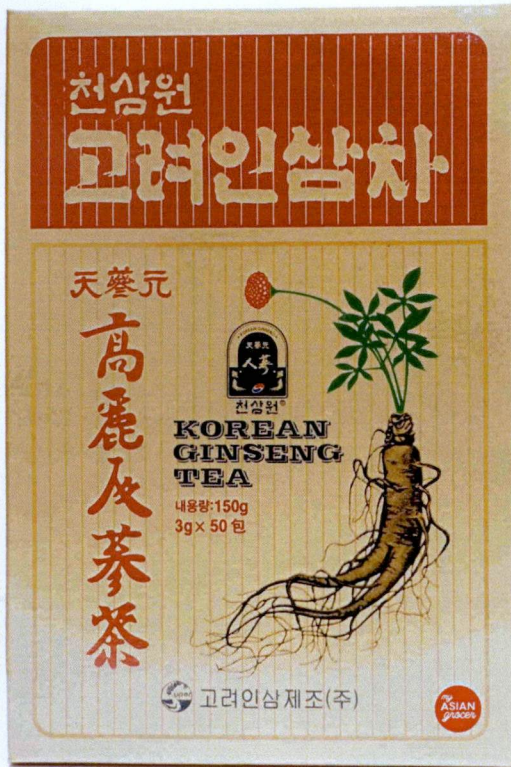
Figure 2. Unregistered Korean Ginseng Tea