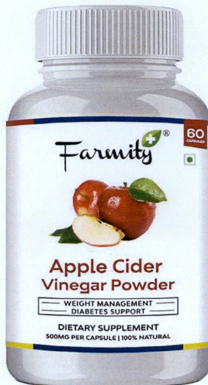
Figure 1. Unregistered FARMITY Apple Cider Vinegar Powder Dietary Supplement

The Food and Drug Administration (FDA) warns the public from purchasing and consuming the following unregistered food supplement and food products: