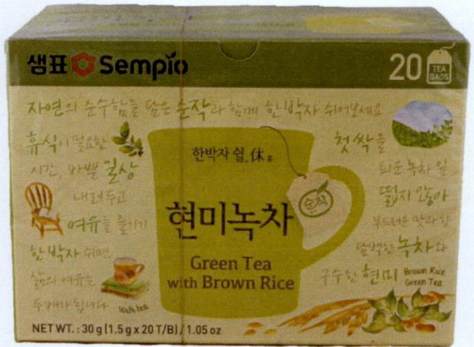
Figure 3. Unregistered SIEMPO Green Tea with Brown Rice