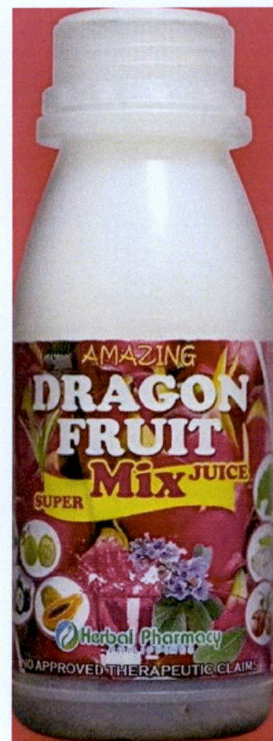
Figure 5. Unregistered AMAZING Dragon Fruit Super Mix Juice