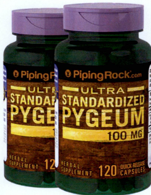
Figure 1. Unregistered PIPING ROCK Ultra Standardized Pygeum Herbal Supplement

The Food and Drug Administration (FDA) advises the public from purchasing and consuming the following unregistered food supplements: