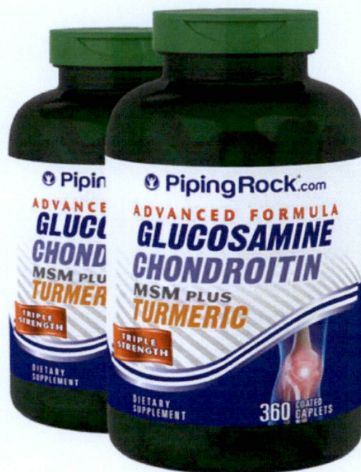
Figure 5. Unregistered PIPING ROCK Advance Triple Strength Chondroitin MSM Plus Turmeric Dietary Supplement

The FDA verified through post-marketing surveillance that the abovementioned food supplements are not authorized and the Certificates of Product Registration (CPR) have not been issued. Pursuant to the Republic Act No. 9711, otherwise known as the “Food and Drug Administration Act of 2009”, the manufacture, importation, exportation, sale, offering for sale,