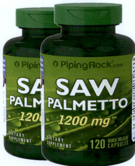
Figure 4. Unregistered PIPING ROCK Saw Palmetto 1200mg Dietary Supplement