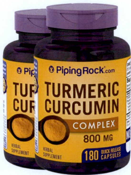
Figure 2. Unregistered PIPING ROCK Standardized Turmeric Curcumin Complex Herbal Supplement