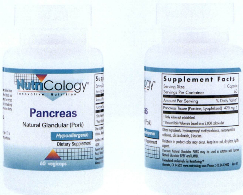
Figure 3. Unregistered NUTRICOLOGY Pancreas Natural Glandular Dietary Supplement