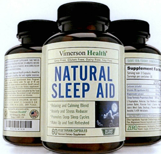
Figure 1. Unregistered VIMERSON HEALTH Natural Sleep Aid Dietary Supplement

The Food and Drug Administration (FDA) advises the public from purchasing and consuming the following unregistered food supplements: