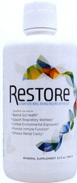
Figure 2. Unregistered RESTORE Mineral Supplement