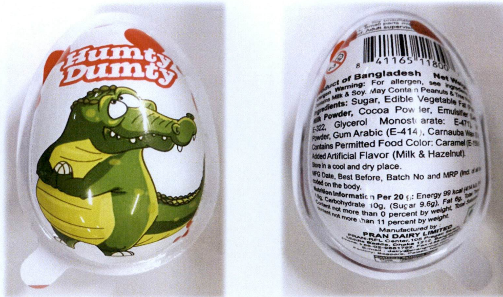
Figure 4. Unregistered CANDY LAND Egg Toy with Candy