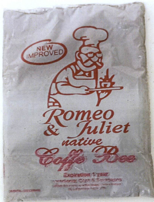
Figure 1. Unregistered ROMEO & JULIET Native Coffee Bee

The Food and Drug Administration (FDA) advises the public from purchasing and consuming the following unregistered food products: