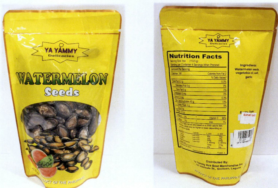
Figure 5. Unregistered YA YAMMY DELICACIES Watermelon Seeds

The FDA verified through post-marketing surveillance that the abovementioned food products are not authorized and the Certificates of Product Registration (CPR) have not been issued. Pursuant to the Republic Act No. 9711, otherwise known as the “Food and Drug Administration Act of 2009”, the manufacture, importation, exportation, sale, offering for sale, distribution, transfer, non-consumer use, promotion, advertising or sponsorship of health products without the proper authorization is prohibited.