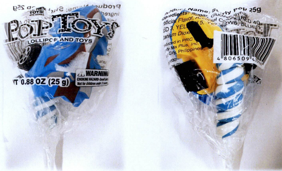
Figure 2. Unregistered POPTOYS Lollipop and Toy