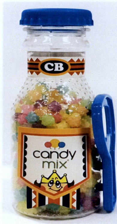
Figure 3. Unregistered CB Candy Mix