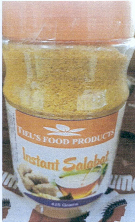
Figure 3. Unregistered TIEL'S FOOD PRODUCTS Instant Salabat, 425g