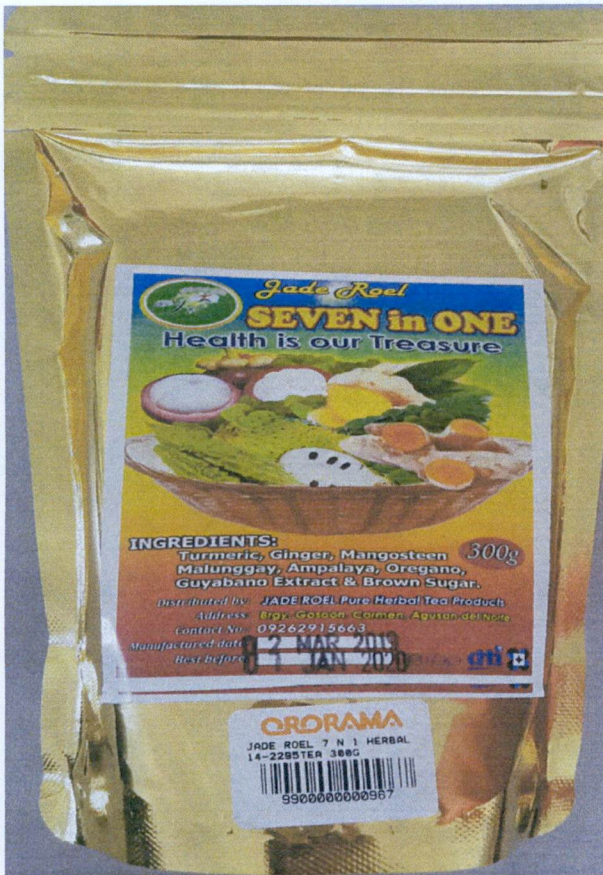
Figure 2. Unregistered JADE ROEL Seven In One Powder, 300mg