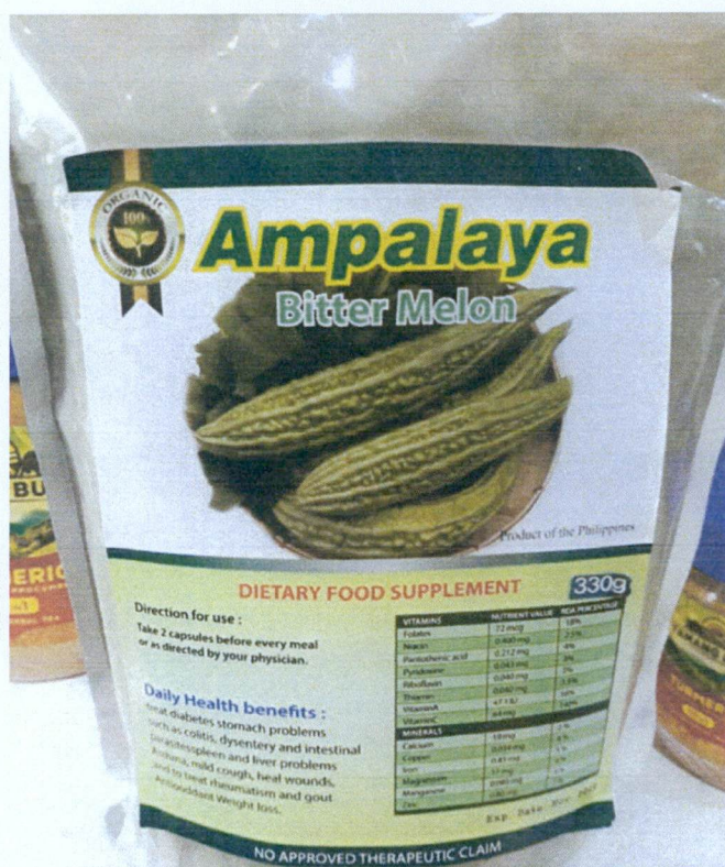
Figure 1. Unregistered Ampalaya Bitter Melon Dietary Food Supplement

The Food and Drug Administration (FDA) warns the public from purchasing and consuming the following unregistered food supplement and food products: