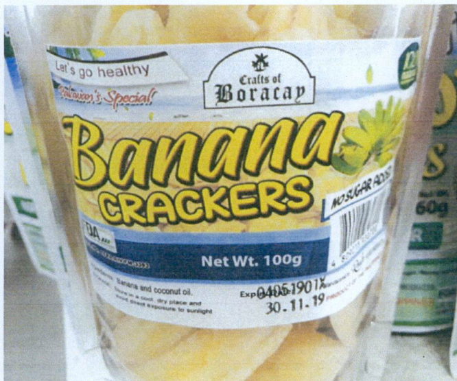
Figure 4. Unregistered CRAFTS OF BORACAY Banana Crackers, 100g