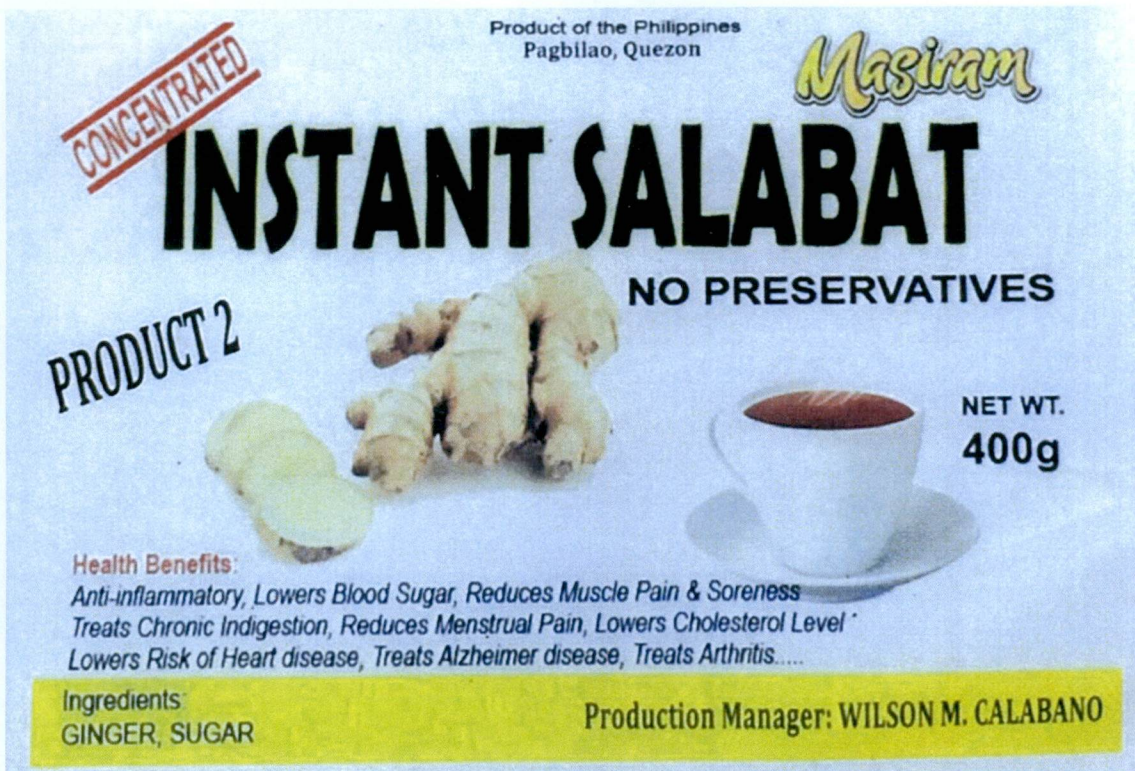
Figure 2. Unregistered MASIRAM Instant Salabat