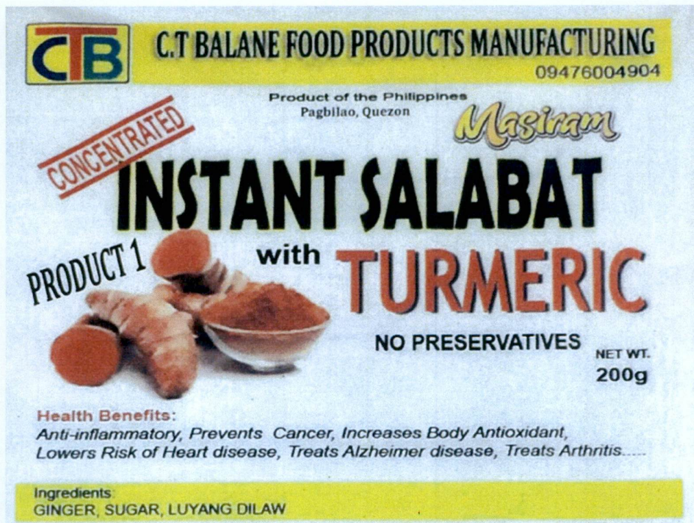
Figure 1. Unregistered MASIRAM Instant Salabat with Turmeric

The Food and Drug Administration (FDA) advises the public from purchasing and consuming the following unregistered food products: