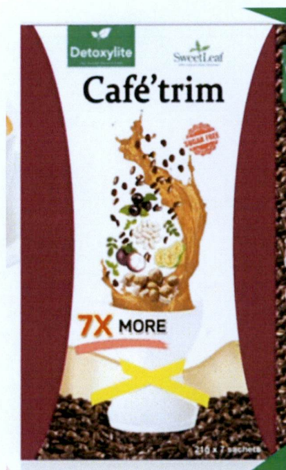
Figure 5. Unregistered DETOXYLITE SweetLeaf Café Trim

The FDA verified through post-marketing surveillance that the abovementioned food products are not authorized and the Certificates of Product Registration (CPR) have not been issued. Pursuant to the Republic Act No. 9711, otherwise known as the “Food and Drug Administration Act of 2009”, the manufacture, importation, exportation, sale, offering for sale, distribution, transfer, non-consumer use, promotion, advertising or sponsorship of health products without the proper authorization is prohibited.