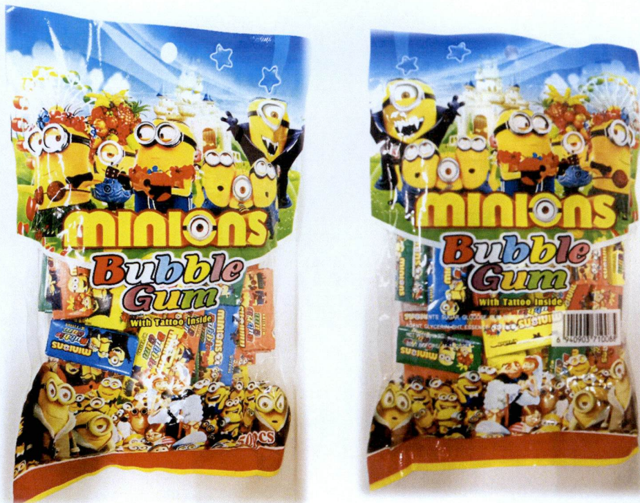
Figure 3. Unregistered MINIONS Bubble gum with Tattoo inside