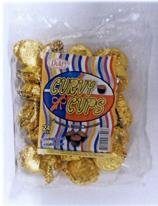
Figure 2. Unregistered DUKE'S Curvy Cups Premium Milk Chocolate