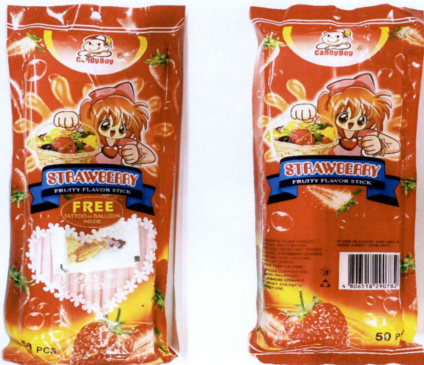
Figure 1. Unregistered CANDY BOY® Strawberry Fruity Flavor Stick

The Food and Drug Administration (FDA) advises the public from purchasing and consuming the following unregistered food products: