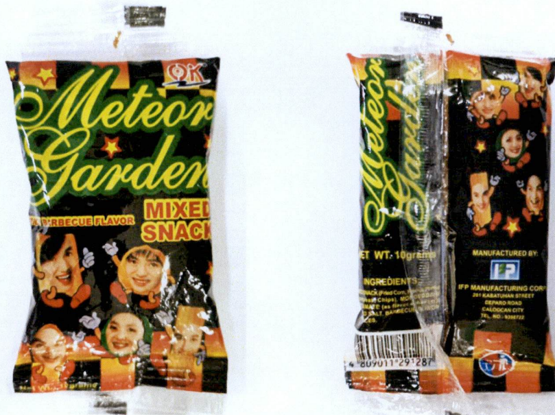
Figure 5. Unregistered OK® Meteor Garden Mix Snack – Spicy Barbeque Flavor

The FDA verified through post-marketing surveillance that the abovementioned food products are not authorized and the Certificates of Product Registration (CPR) have not been issued. Pursuant to the Republic Act No. 9711, otherwise known as the “Food and Drug Administration Act of 2009”, the manufacture, importation, exportation, sale, offering for sale, distribution, transfer, non-consumer use, promotion, advertising or sponsorship of health products without the proper authorization is prohibited.