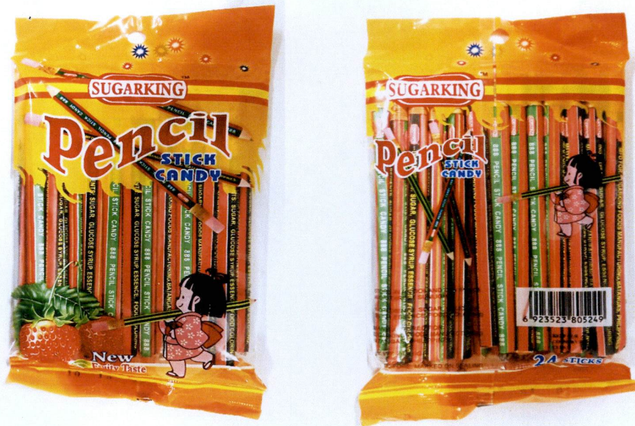
Figure 4. Unregistered SUGARKING™ Pencil Stick Candy