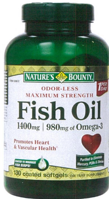
Figure 3. Unregistered NATURE'S BOUNTY Fish Oil 1400mg 980mg of Omega-3 Dietary Supplement Coated Softgels