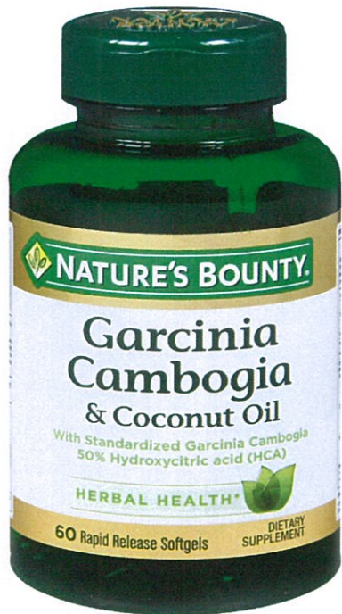
Figure 2. Unregistered NATURE'S BOUNTY Garcinia Cambogia & Coconut Oil Dietary Supplements Softgels