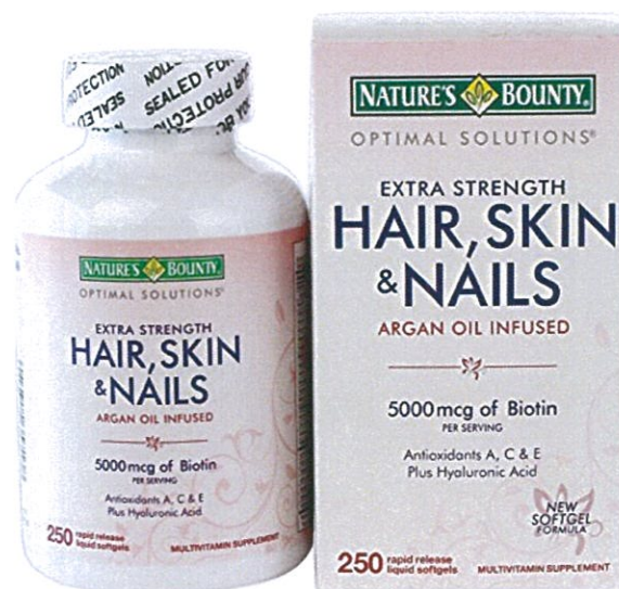
Figure 1. Unregistered NATURE'S BOUNTY OPTIMAL SOLUTIONS Extra Strength Hair, Skin & Nails Argan Oil Infused 5000mcg Biotin per Serving Antioxidants A, C & E plus Hyaluronic Acid Multivitamin Supplement Liquid Softgels

The Food and Drug Administration (FDA) warns the public from purchasing and consuming the following unregistered food supplements: