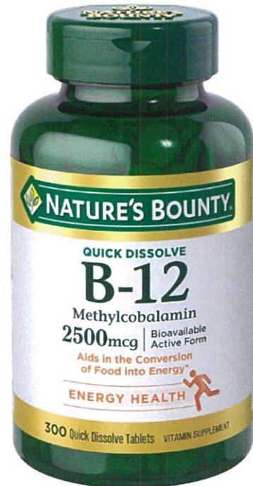
Figure 5. Unregistered NATURE'S BOUNTY B-12 Methylcobalamin 2500 mcg Vitamin Supplement Quick Dissolve Tablets