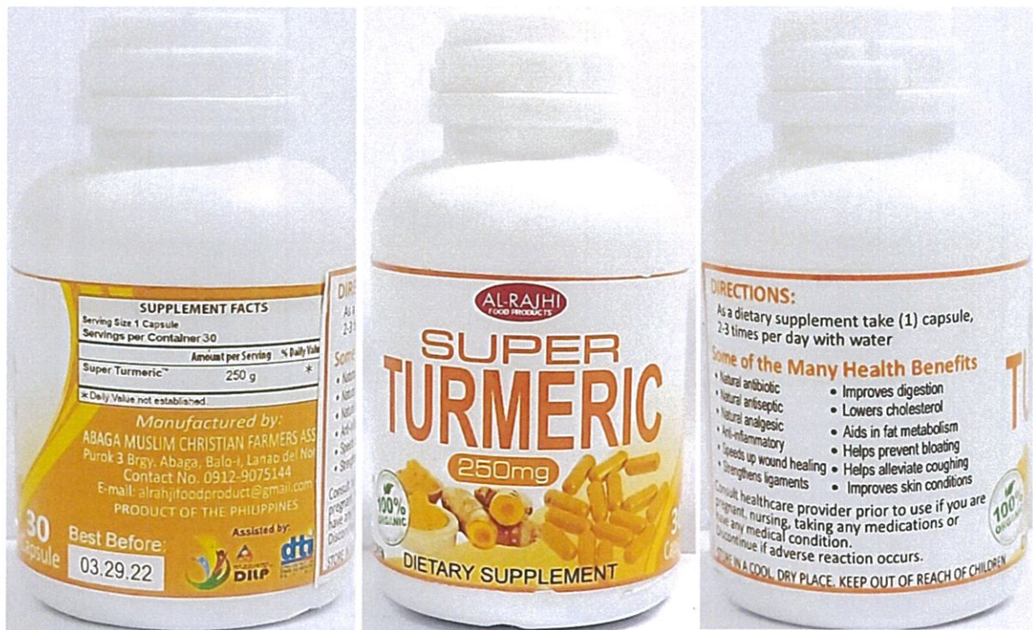
Figure 4. Unregistered AL RAJHI FOOD PRODUCTS Super Turmeric Dietary Supplement Capsules