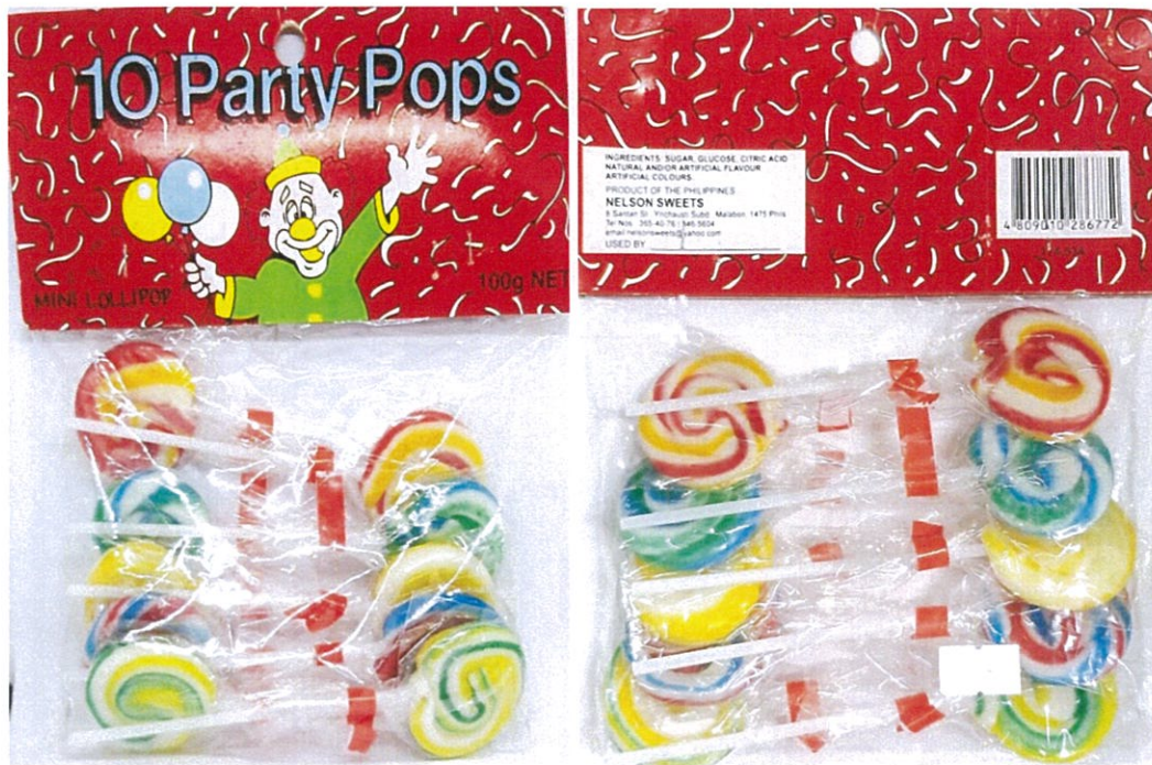
Figure 1. Unregistered 10 Party Pops, Mini Lollipop

The Food and Drug Administration (FDA) warns the public from purchasing and consuming the following unregistered food products: