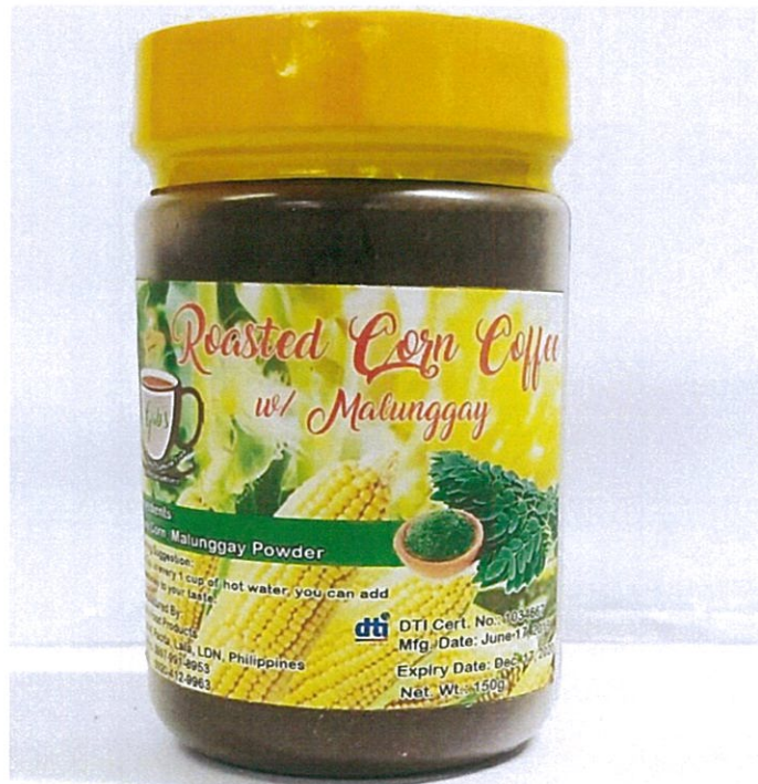
Figure 5. Unregistered GAB'S Roasted Corn Coffee with Malunggay

The FDA verified through post-marketing surveillance that the above mentioned food products and food supplement are not authorized and the Certificates of Product Registration have not been issued. Pursuant to the Republic Act No. 9711, otherwise known as the “Food and Drug Administration Act of 2009”, the manufacture, importation, exportation, sale, offering for sale, distribution, transfer, non-consumer use, promotion, advertising or sponsorship of health products without the proper authorization is prohibited.