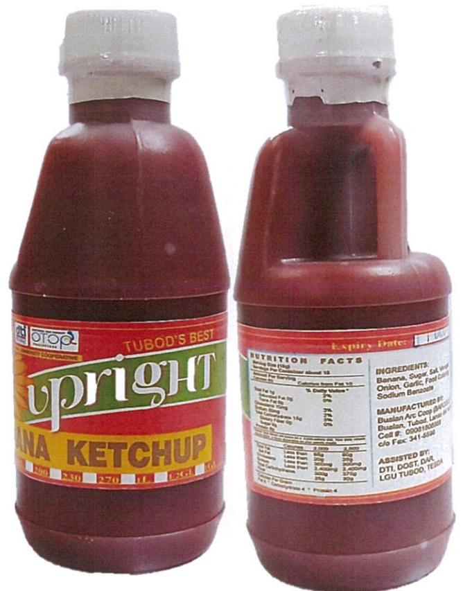
Figure 3. Unregistered TUBOD'S BEST Upright Banana Ketchup