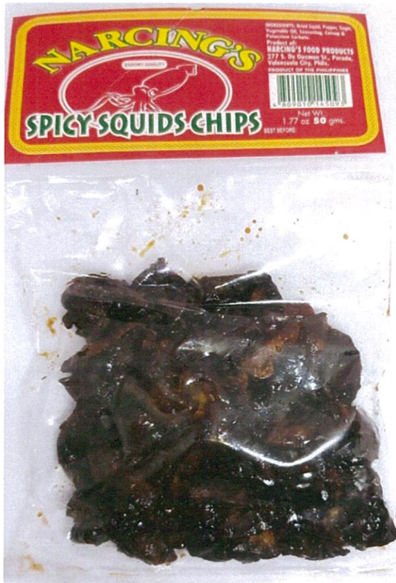
Figure 2. Unregistered Narcing's Spicy Squid Chips