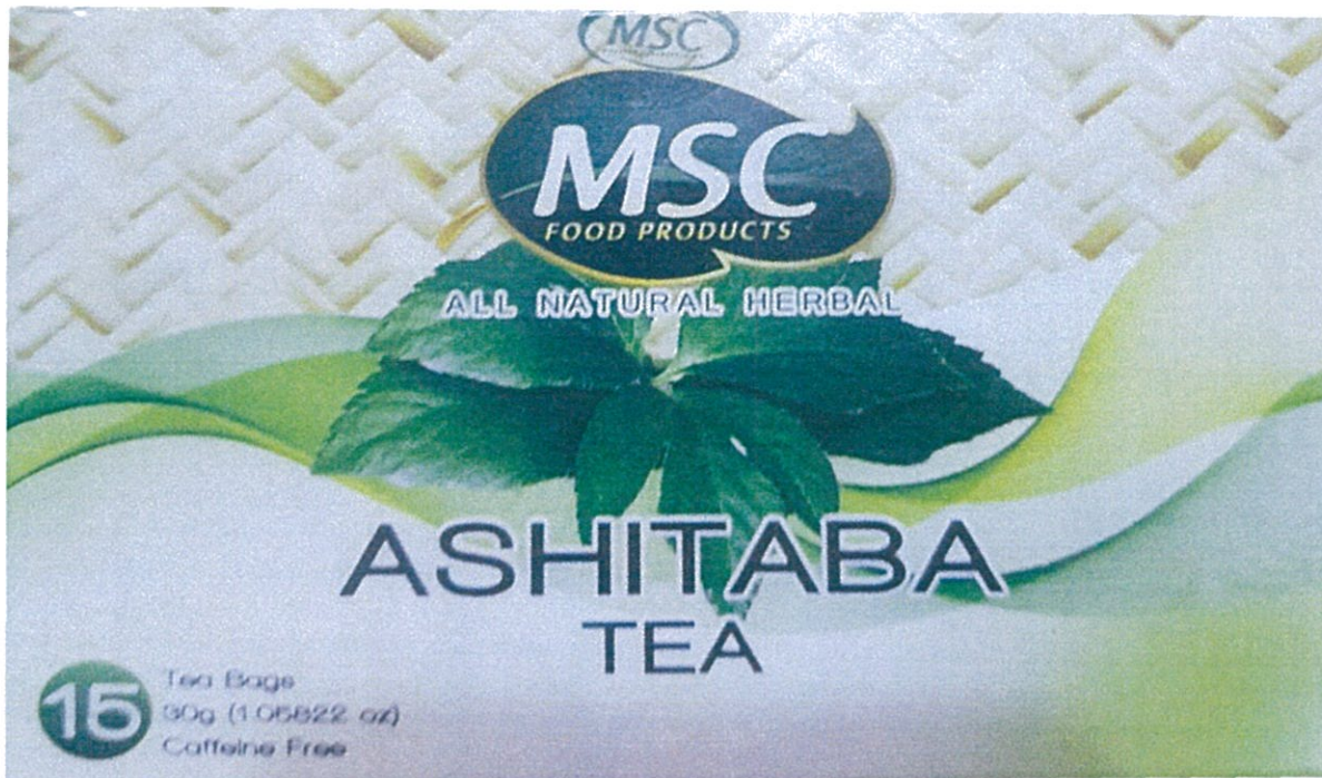
Figure 1. Unregistered MSC FOOD PRODUCTS Ashitaba Tea

The Food and Drug Administration (FDA) warns the public from purchasing and consuming the following unregistered food products: