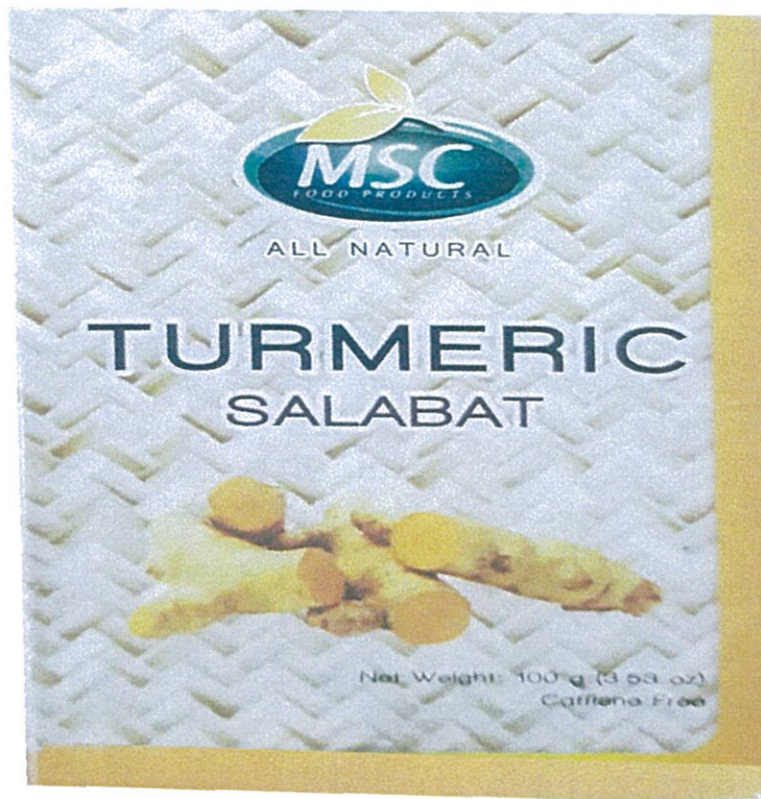
Figure 4. Unregistered MSC FOOD PRODUCTS Turmeric Salabat