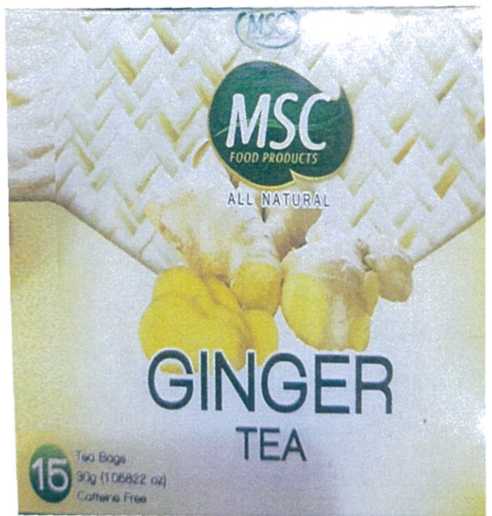
Figure 3. Unregistered MSC FOOD PRODUCTS Ginger Tea