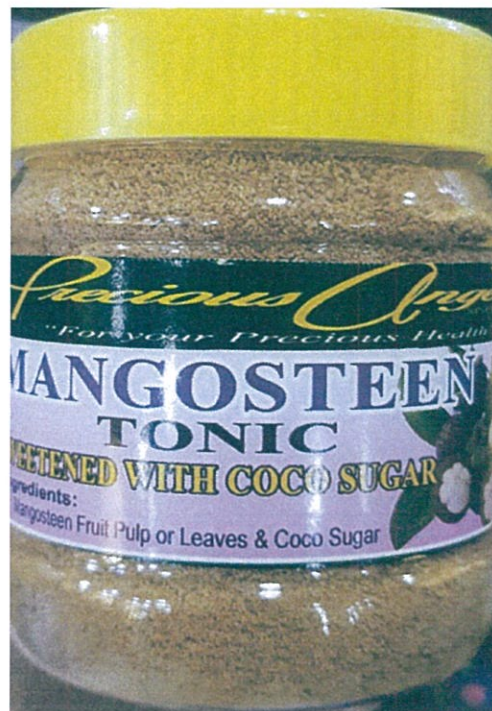
Figure 1. Unregistered PRECIOUS ANGELS Mangosteen Tonic Sweetened w/ Coconut Sugar