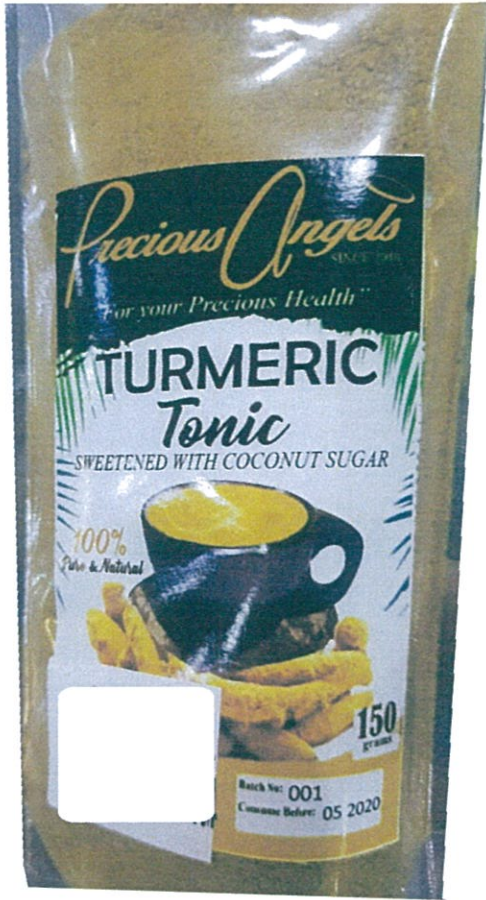
Figure 2. Unregistered PRECIOUS ANGELS Turmeric Tonic Sweetened w/ Coconut Sugar