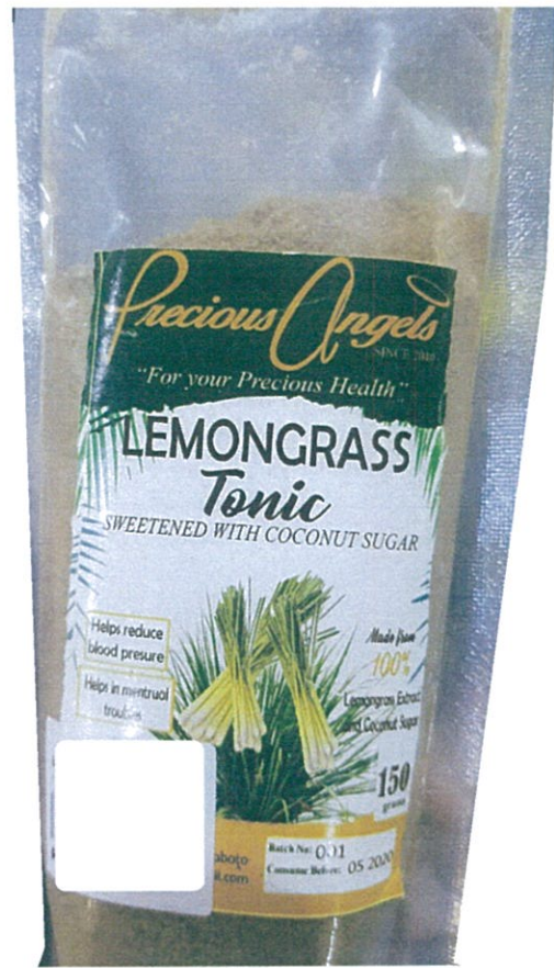
Figure 3. Unregistered PRECIOUS ANGELS Lemongrass Tonic Sweetened w/ Coconut Sugar