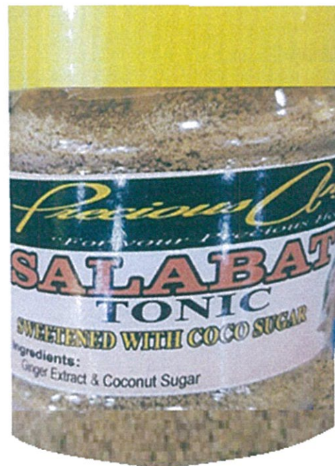
Figure 5. Unregistered PRECIOUS ANGELS Salabat Tonic Sweetened w/ Coconut Sugar