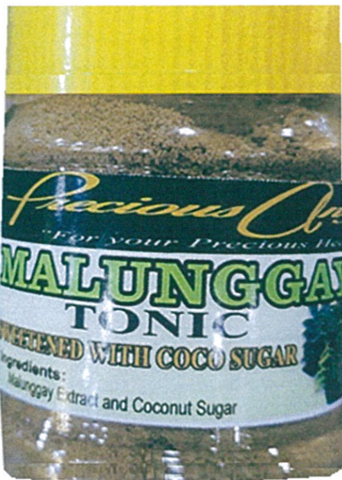
Figure 4. Unregistered PRECIOUS ANGELS Malunggay Tonic Sweetened w/ Coconut Sugar